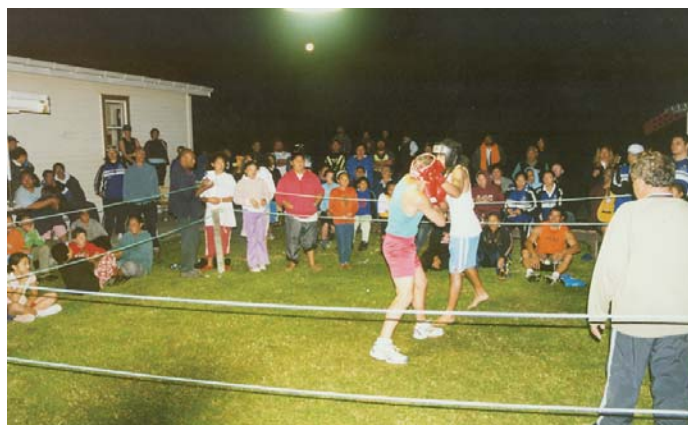
Above: A big crowd gathered round the ring to watch the last exhibition fight of the night, with the moon in the background

Other East Coast coaches and boxing clubs are Rick Haerewa coaching