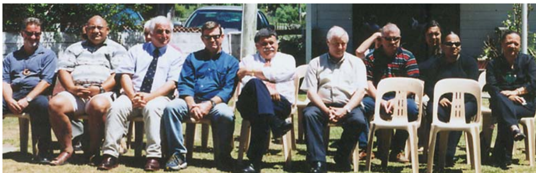
HNZN manuhiri at Kariaka Marae