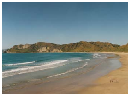
Kaiaua Beach, Tolaga Bay - at low tide

This sets Ngati Porou and Te Whanau-a-Apanui aside from the vast majority of other iwi and has served to strengthen the ability of Ngati Porou and Te Whanau-a-Apanui to maintain and enforce their mana insofar as access to the sea and its resources is concerned.