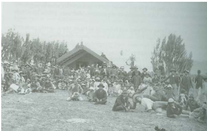
Hui at Pakirikiri, February 1887