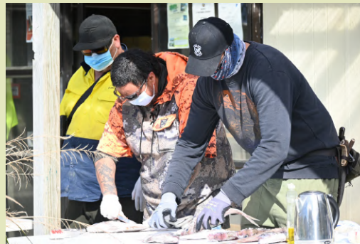
No muck around to the brothers. Straight into it! Te Puna Manaaki a Ruataupare, Onepoto.