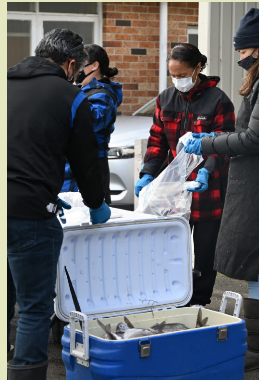
Te Whanau a Hunaara also granted fishing permits for the gathering of ika. Here they are on Rata Street in Te Araroa packing for pakeke in their rohe.