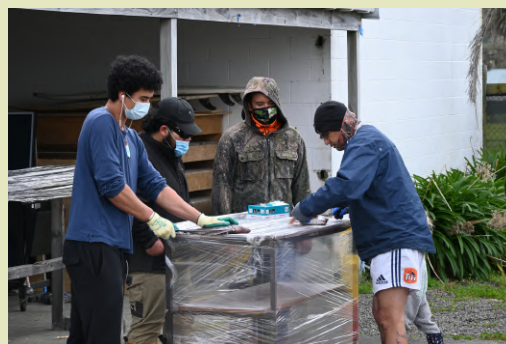
Ngati Porou innovators - make shift fish processing unit all ready to go at the Tokomaru United Rugby Club. Ka mau te wehi!