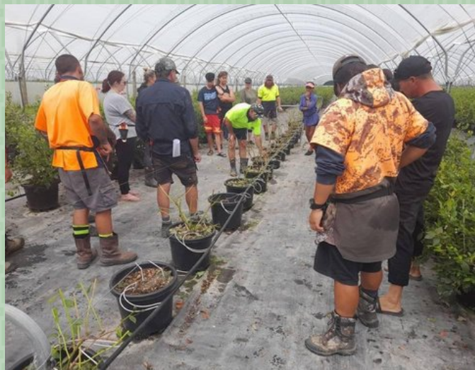
Kaimahi in training at Hauiti Berries - In 2019 Holdco entered into a joint venture agreement with Hauiti Incorporation to grow four hectares of blueberries on Hauiti Inc land creating local employment and income.