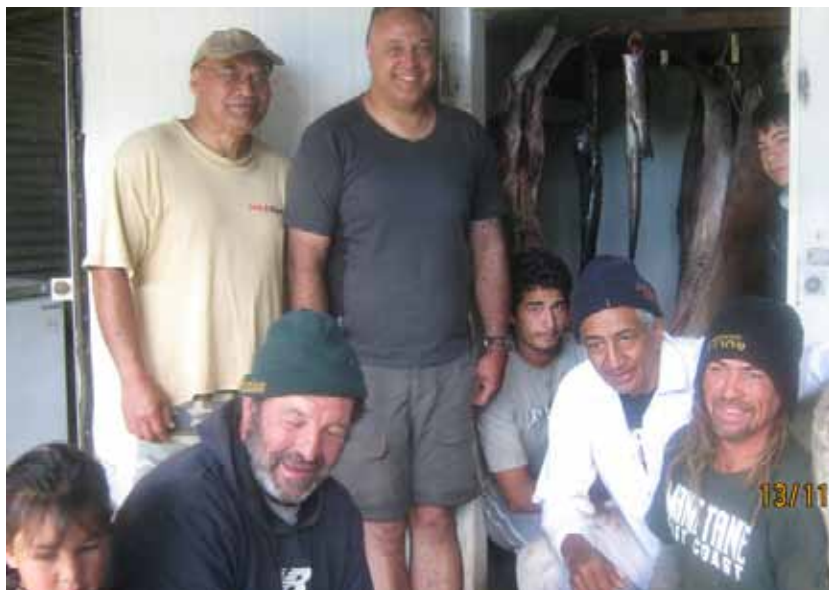
Mana Tane members with yummy fresh eels in the chiller. The eels have been cleaned, hung up and are now ready to prepare for eating