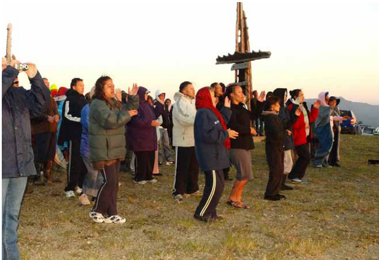
Haka Pohiri welcomes in the new year

she wanted to experience something Maori, but wanted it to be authentic and not plastic,” he said. “After the ceremony she told me she was really appreciative that Ngati Porou people had allowed visitors like her to attend the ceremonial occasion and felt privileged to share the experience with us. Lots of tourists have said similar remarks to me, that our ceremony isn’t staged, it’s our reality and part of our way of life.”