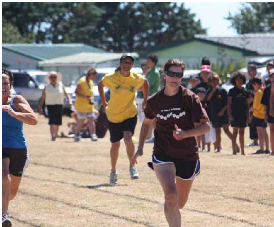
Sprinting to the finish line

the National Maori Masters Tournament. Whangara threw straight and true to take out the Darts . Te Aowera and Te Rawheoro were first equal in the Pakeke Euchre and there was Waiparapara and daylight with 30 of their young people participating in the Nati Kids and 155 in the Fun Walk . Golf and the Ripper Rugby were owned by Reporua marae this year and the Bowls went 4 ways from the jack; Hinerupe, Waiparapara, Hinetamatea and Okuri. Waiparapara served up the finest Nati and Healthy produce styles and were also crowned supreme Ngati Porou Linedancing champions at the festival this year.