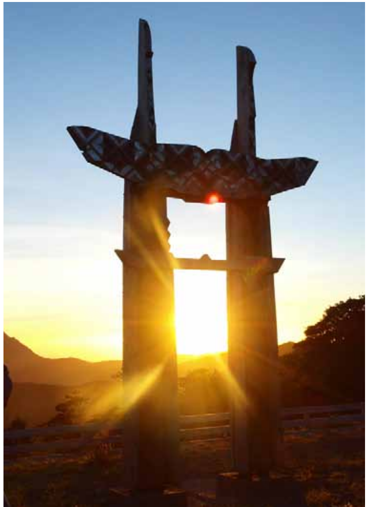
The first sunrise of 2010 from Te Takapou a Maui