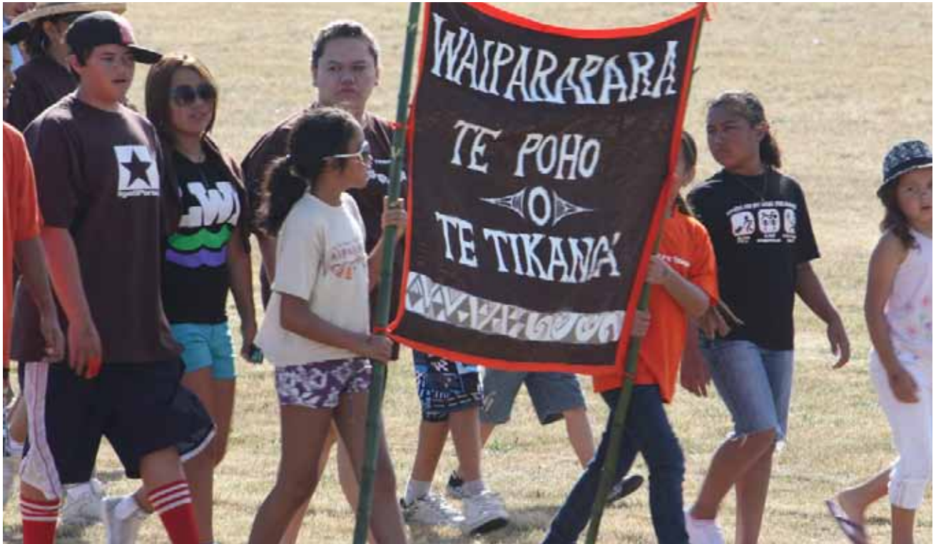
2010 Pa Wars Winners Waiparapara Marae

The power and the passion of Ngati Porou marae pride was in full force as more than 4000 kith and kin descended on Mangarara Pah on Wairoro, Uawa, for the Ngati Porou Inter marae Sports Day 3 January 2010.