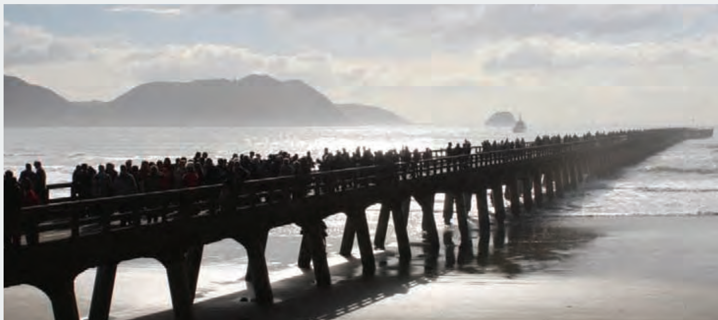
Rededication of the Tolaga Bay Wharf.