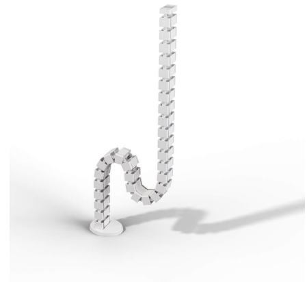
Flip-Top Charging Port