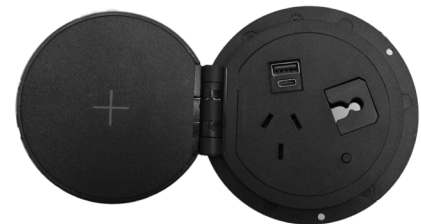
Flip-Top Charging Port