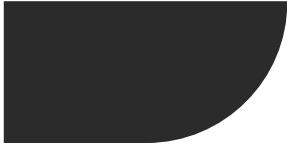
Black Satin (Frame)

For Dulux, Interpon or RAL colours, please contact your local sales representative.