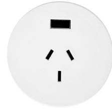
In-Desk Charging Port

The cable hose of 130cm has a weighted footplate to keep all loose cables under the desk neat and tidy. It can be easily attached to the underside of the desk top by using a magnet if you don't want to screw it and damage the desk top.