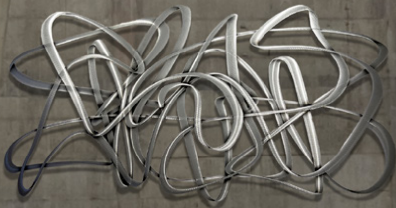
untitled 2024 acrylic on aluminium 192 x 85 x 0,2 cm