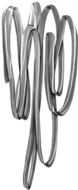
untitled 2024 acrylic on aluminium 110 x 65 x 0,2 cm