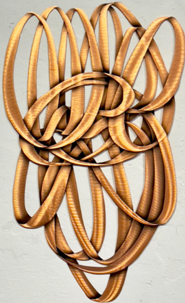
untitled 2025 acrylic on copper 92 x 73 x 0,2 cm