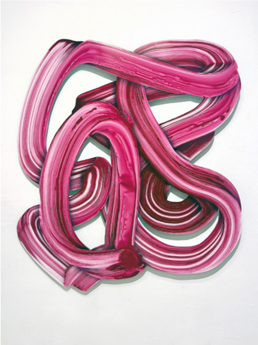
untitled 2025 126 x 113 cm lacquer on aluminium