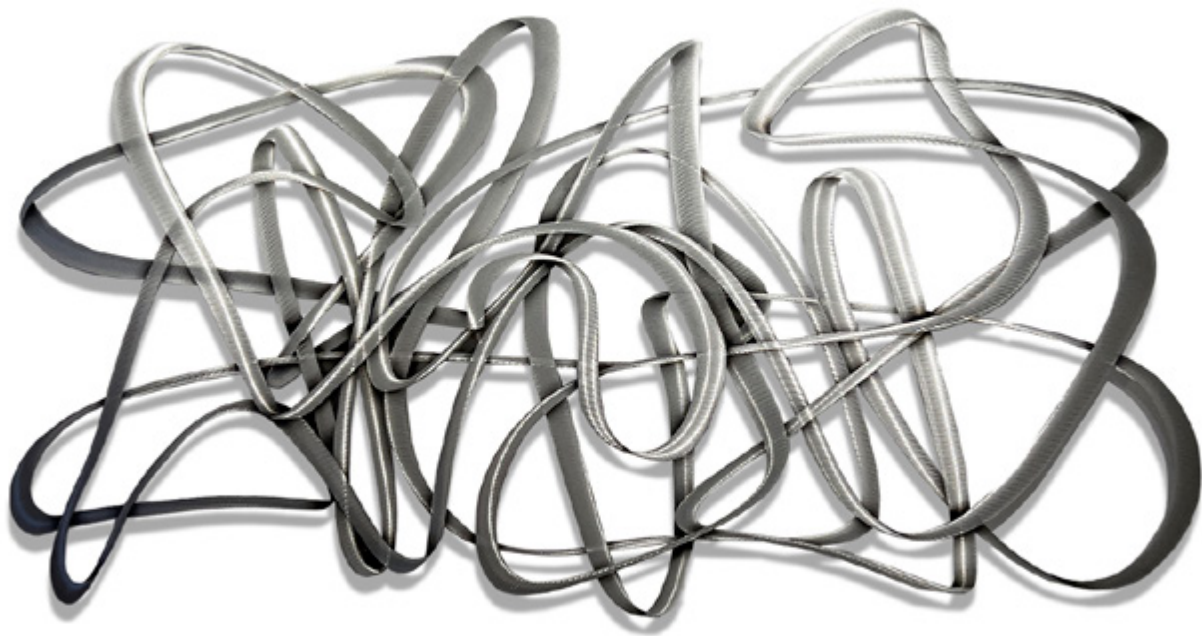
untitled 2024 192 x 85 cm acrylic on hand cut aluminium