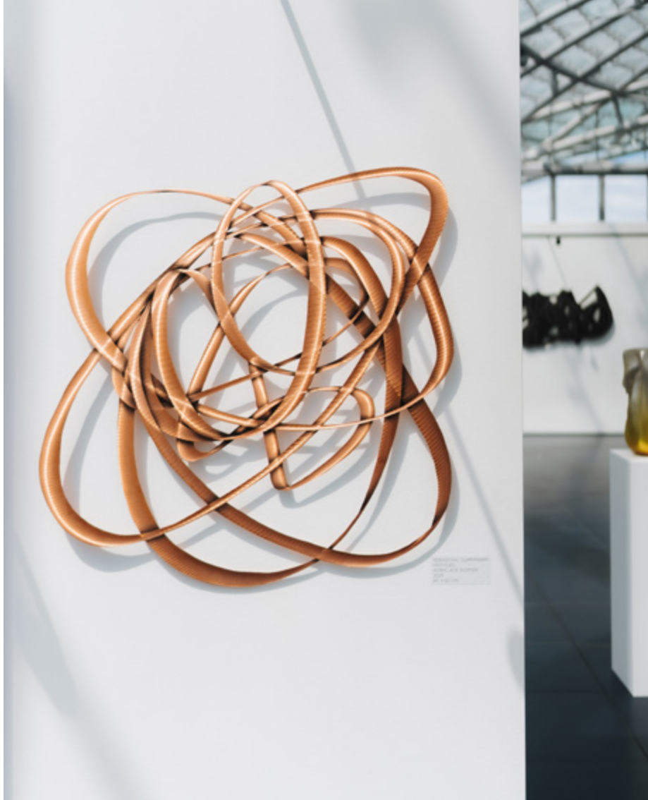
untitled 2025 92 x 73 cm acrylic on copper