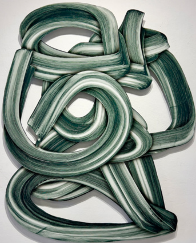
untitled 2025 148 x 120 cm lacquer on hand cut aluminium