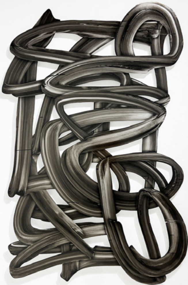
untitled 2025 220 x 140 cm acrylic on hand cut aluminium