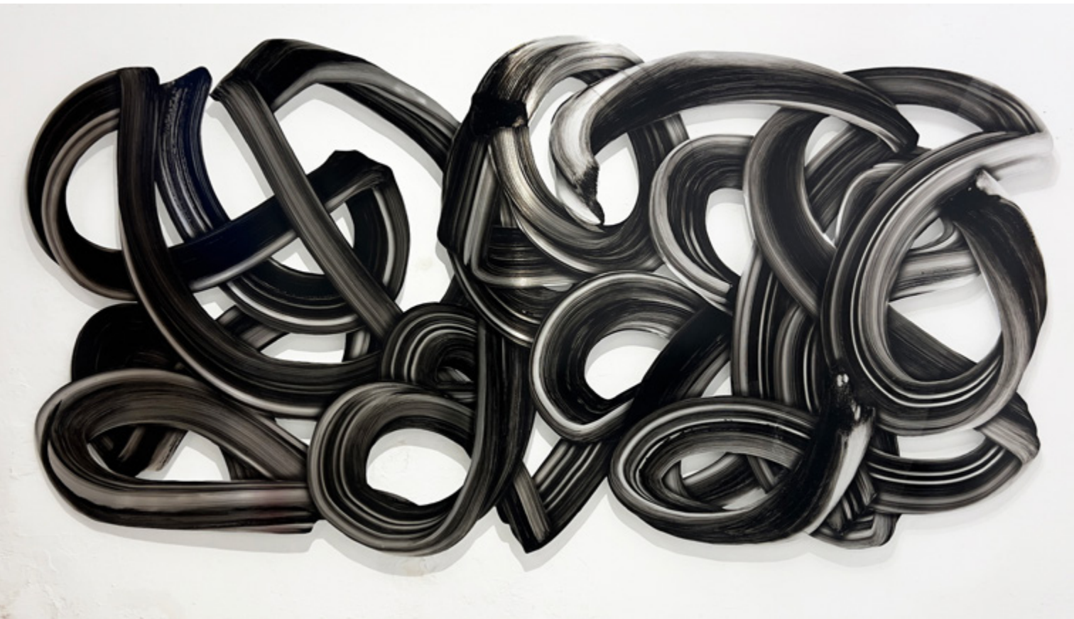
untitled 2025 145 x 287 cm lacquer on aluminium