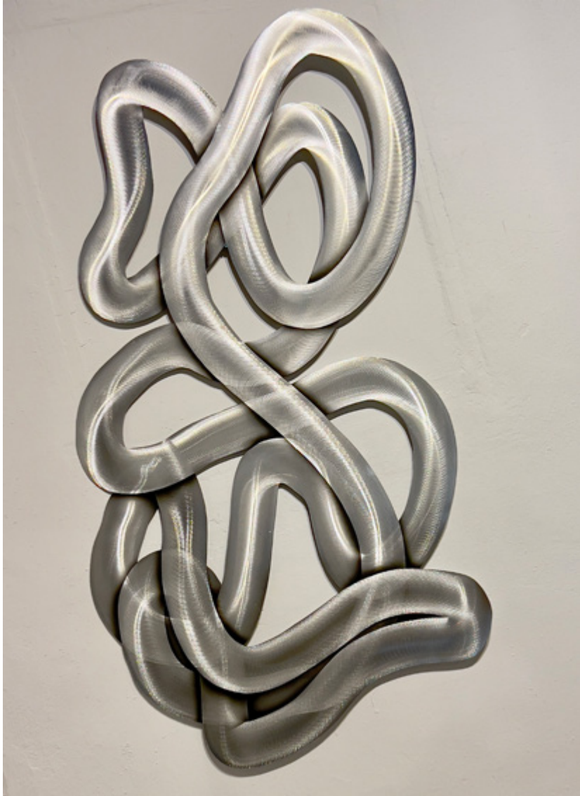
untitled 2024 192 x 83 cm acrylic on hand cut aluminium