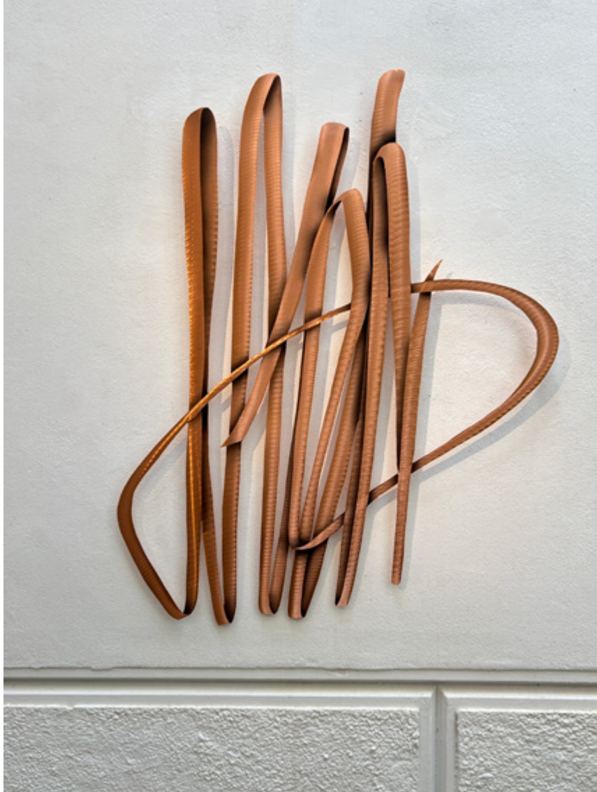
untitled 2025 85 x 65 cm acrylic on hand cut copper