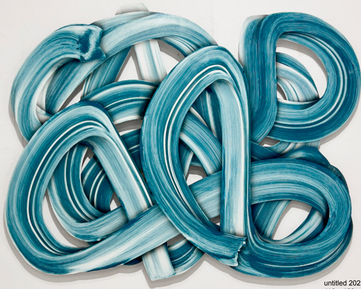
untitled 2025 116 x 150 cm lacquer on aluminium