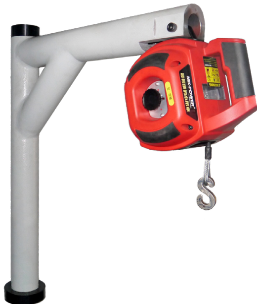
Crane arm options available for lifting heavy heads into place (Customer to provide their own certified hoist)