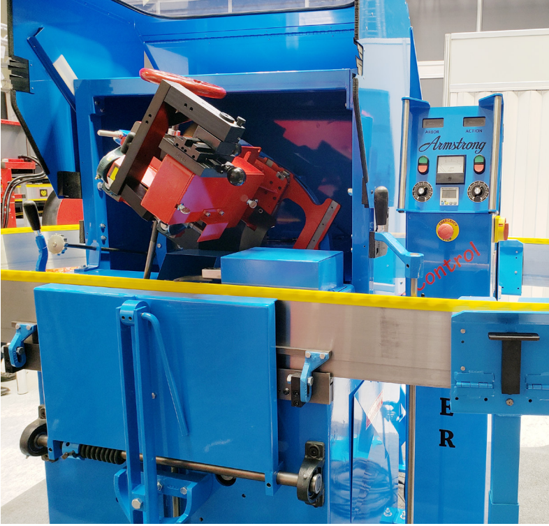
No. 4 Bandsaw sharpener shown with optional safety hood, ShapeUp, and StrongArm II clamp.