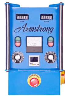
Control Panel user interface manages all machine motion.

GREAT PERFORMERS withstand the test of time. Armstrong Band Saw Sharpeners have passed this test and continue to serve saw filers, as they have for more than 50 years. Armstrong machines are prized worldwide for their precision performance, rugged dependability, ease of operation and readily available spare parts. All adjustments are positive and easy to make for many years of fine, trouble-free service.