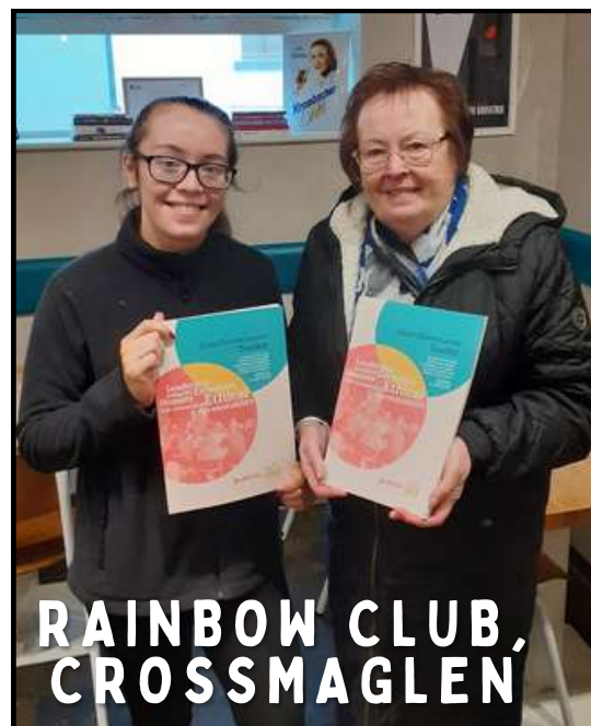
RAINBOW CLUB, CROSSMAGLEN