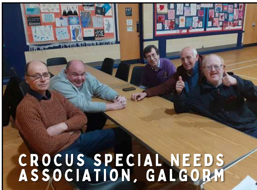
CROCUS SPECIAL NEEDS ASSOCIATION, GALGORM

If your group is based in a rural area and would like to get involved, please contact helen@youthaction.org