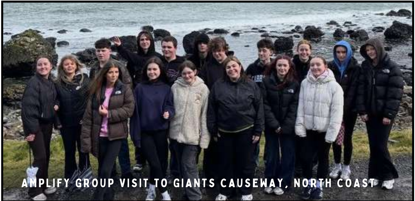
AMPLIFY GROUP VISIT TO GIANTS CAUSEWAY, NORTH COAST