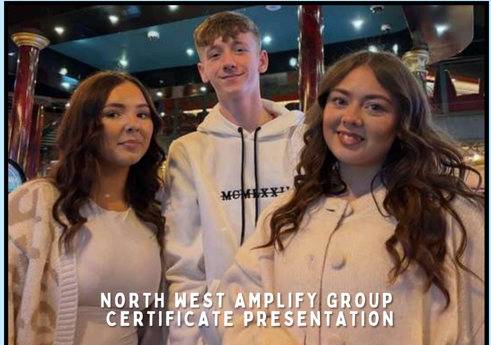
NORTH WEST AMPLIFY GROUP CERTIFICATE PRESENTATION