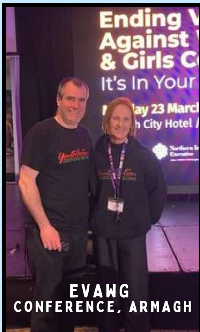
EVANG CONFERENCE, ARMAGH