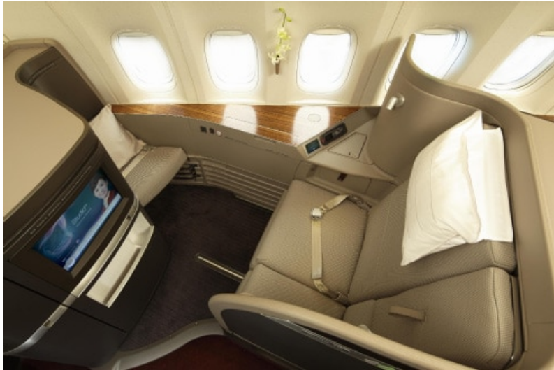
Cathay Pacific First Class

Advance Planner: Tokyo Discount Business Class Availability from Los Angeles and Many Other Cities with Miles / Points (4+ Seats)