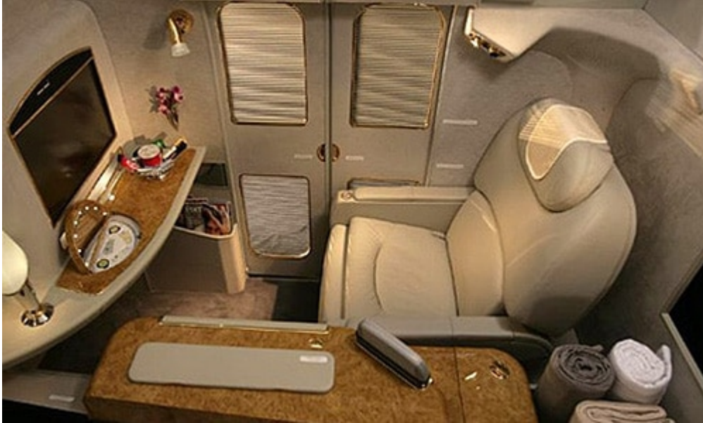
Emirates First Class

Scads of Single Seat Emirates *First Class* from Orlando to Dubai with Miles / Points