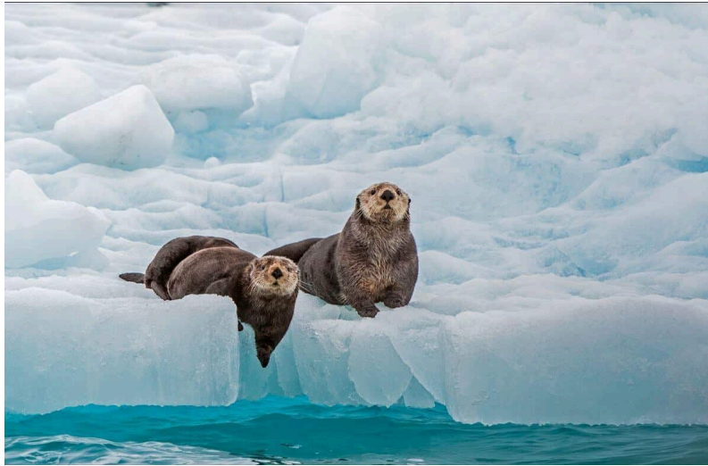
Alaska Airlines. It's all about the partnerships.

For Business and First Class flights, you could net savings of up to 91%. Your miles can also be used for itineraries that don't originate in the U.S., and for amazing round-the-world deals. More on that later.