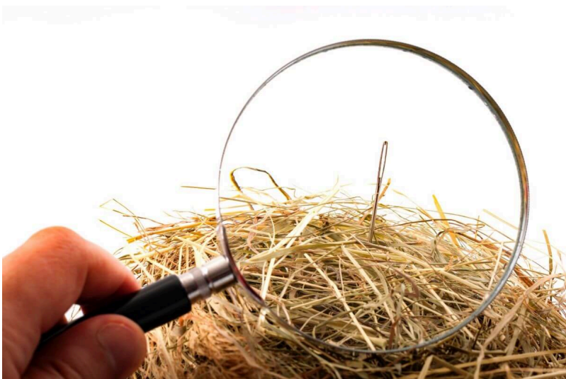
One of only a few finds

Remember not to book backwards , in other words.