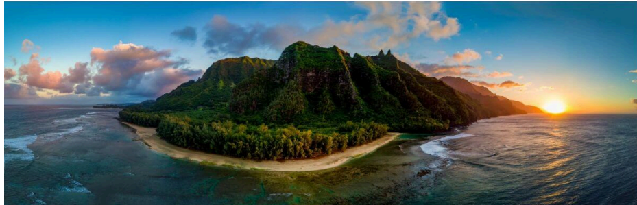
Captivating Kauai and the Napali Coast