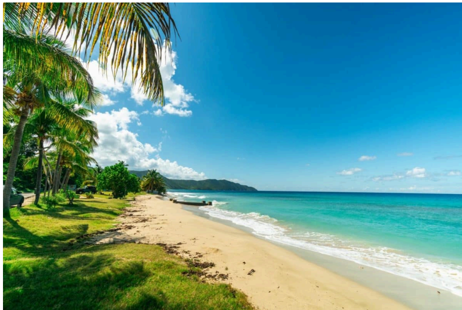
Cane Beach, Saint Croix

Imagine warm turquoise water with soft white sand. Great eating (try the conch fritters, fried kingfish steaks, and decadent rum cake — yum). Charming, historic towns – Christiansted and Frederiksted – founded in the 1700s. Three golf courses including the Carambola course that Golf magazine rates as one of the best in the world. Awesome scuba diving with abundant marine life and lots of shipwrecks to explore. Duty-free shopping, delicious rum, and a low-key, laid-back tropical vibe. Just writing this makes me want to get out of this elevator and go.