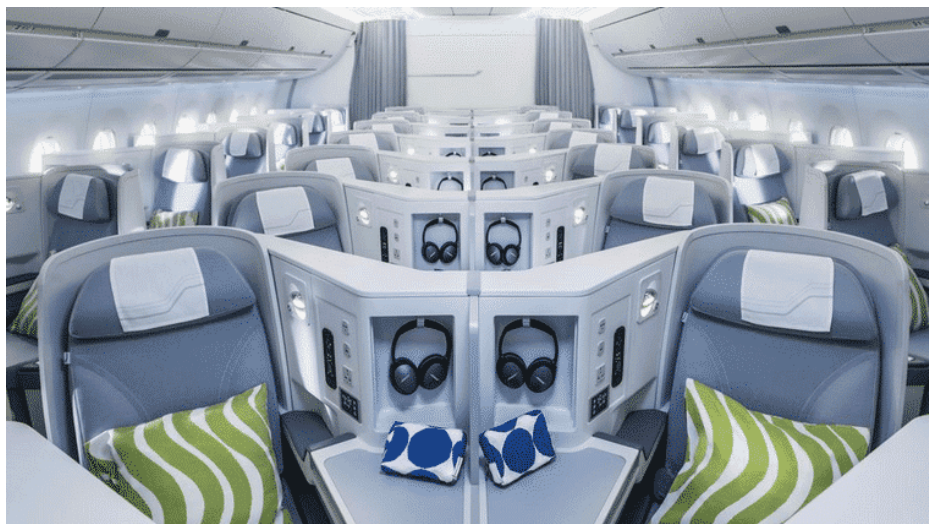
Finnair's Business Class Cabin

You can also explore beyond Helsinki. Beautiful St. Petersburg is just an hour's flight away (4.5 hours by train), and Stockholm is about an hour and 20 minutes. Both cities are easily reachable by ferry as well.