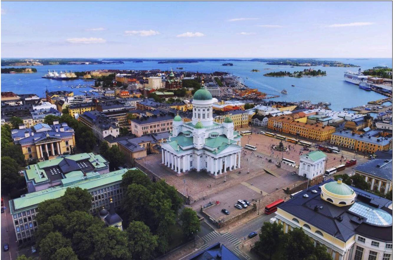
Helsinki Cathedral and surrounds

Helsinki offers wonderful cultural opportunities at HAM, the Helsinki Art Museum, and the Design Museum. These are a great way to understand the country that prides itself on contemporary design.