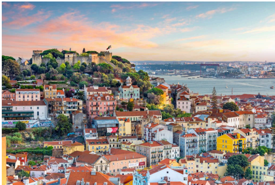
Colorful Lisbon at sunset

For travel in summer 2021, which is peak season for economy fares to Europe (based on sample travel dates of June 23-July 7), you can book Newark-Lisbon nonstop in Business Class on TAP for just $1,152. Economy during the same time window is $1,249 for a nonstop flight on United. So that's a less-than-free upgrade. It's like they're paying you to get a better flight! That's why it's super important to check those prices before committing to a cabin when you're booking right now.