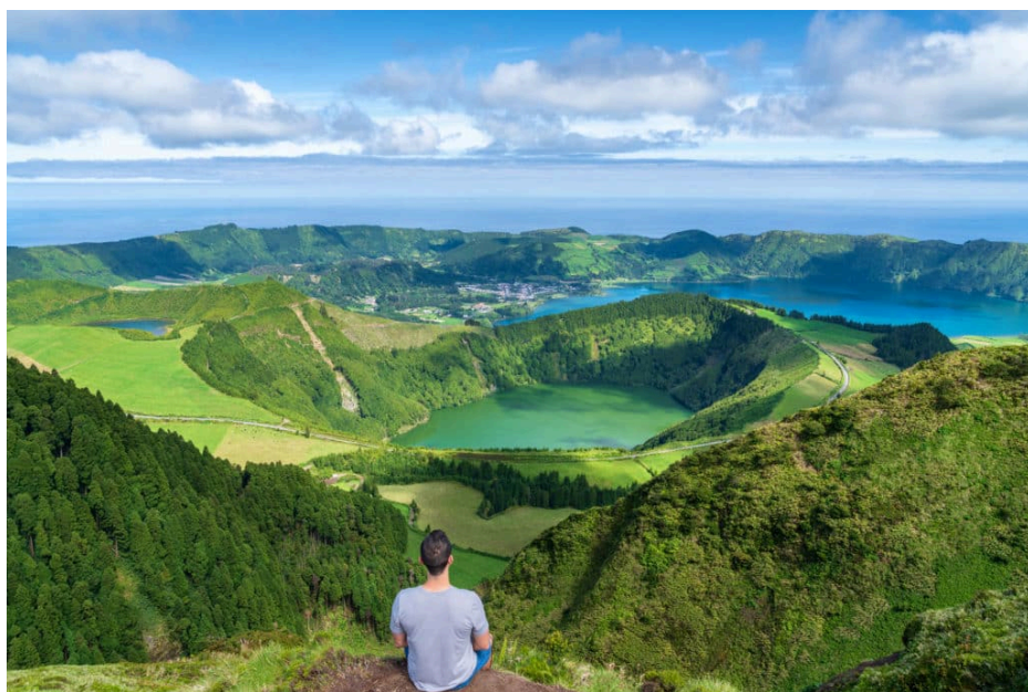
The Sete Cidades

The Azores: A Portugese island chain about 850 miles west of the mainland, this is an inviting water paradise with whale watching, snorkeling and diving. The Sete Cidades, a three-mile-diameter volcanic crater. The historic hub of Ponta Delgada. Biking and hiking. Delicious local cuisine.