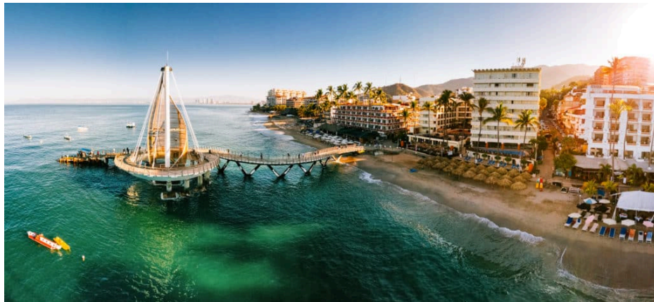
Pristine Puerto Vallarta

Puerto Vallarta: Cobblestone streets. Boutique shops. Spacious beaches. Galleries and sculptures. The Malecón boardwalk.