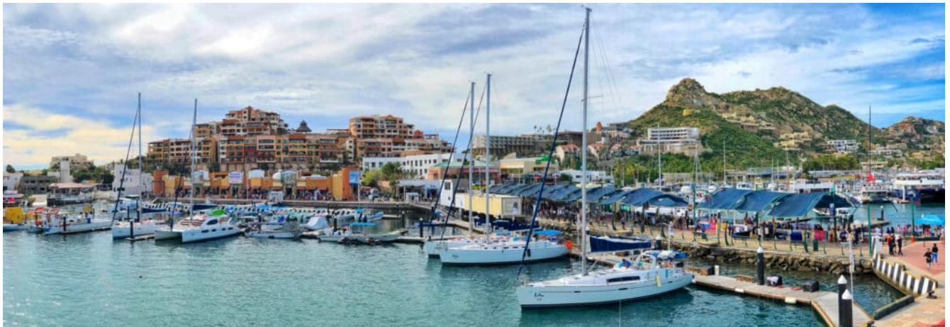
The Marina at Cabo San Lucas

Well, what if you didn't have to miss out on travel? And what better place to go than Mexico for some well-earned R&R? It's the right kind of tropical vaccine a lot of us could use right now.