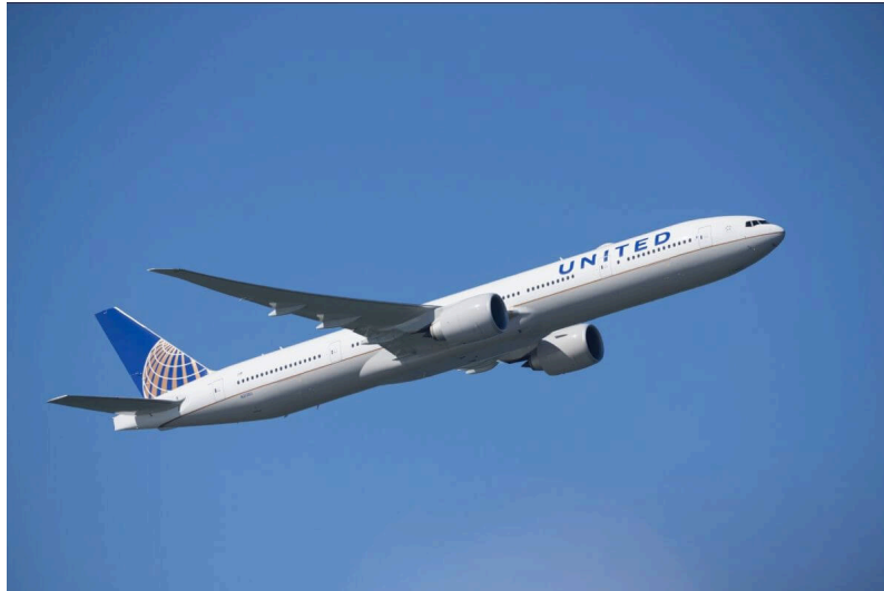
Going up: United's award prices

Nowadays, if you're not careful or not reading FCF's special reports, plan on paying up to 155,000 miles for Business Class one-way to Europe. However, on 29 routes with eight Star Alliance partner airlines, FCF's team found one-ways for as low as 73,000 United miles — saving you ~53%. See FCF's cheat sheet here: