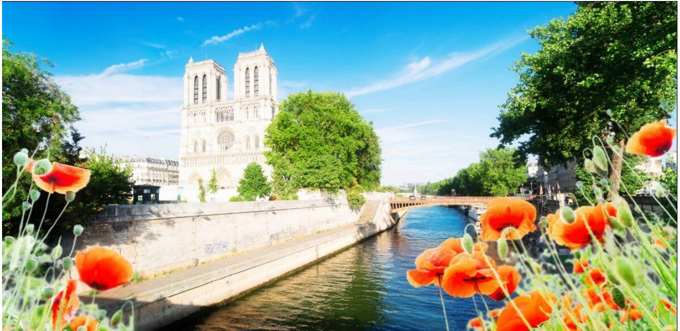
Paris en été