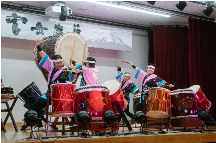
Japanese drum performance (image)