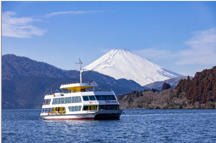
Lake Ashi Cruise (image)