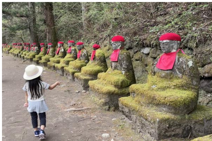
Kanmangafuchi Abyss (image)