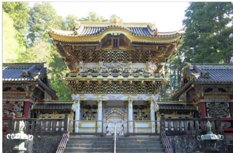
Nikko Toshogu Shrine Yomeimon Gate (image)