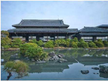
Yanagawa Ohana

[Meet] 9:00 a.m. In front of JTB Travel Gate Tenjin Store main entrance [Train] From Nishitetsu Fukuoka (Tenjin) Station to Dazaifu Station ◆ Dazaifu Tenmangu Shrine (90 min.) - [On Foot] Guided tour & free time for sightseeing [Train] From Dazaifu Station to Nishitetsu Yanagawa Station ◆ Private River Cruise Experience (30 min.) ◆ Tachibana Museum ◆ Yanagawa Ohana Estate & Garden } (60 min.) [Train] From Nishitetsu Yanagawa Station to Nishitetsu Fukuoka (Tenjin) Station [End] 16:30 p.m. Nishitetsu Fukuoka (Tenjin) Station