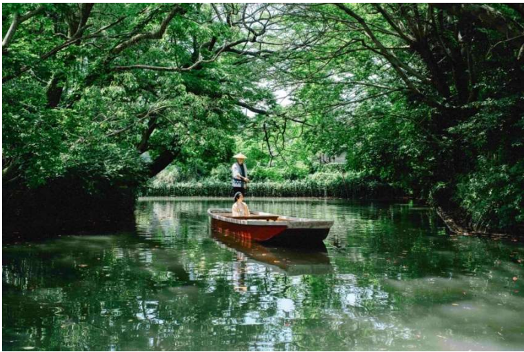
Yanagawa River Cruise Experience