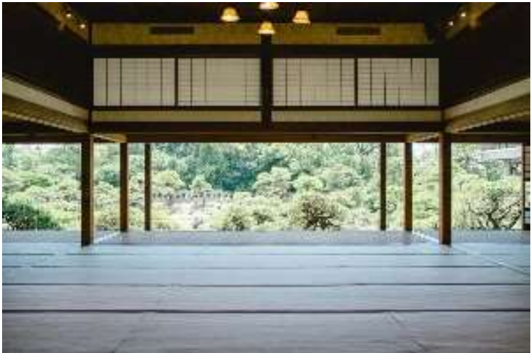
Yanagawa Ohana / Photo courtesy of Yanagawa Ohana Estate & Garden