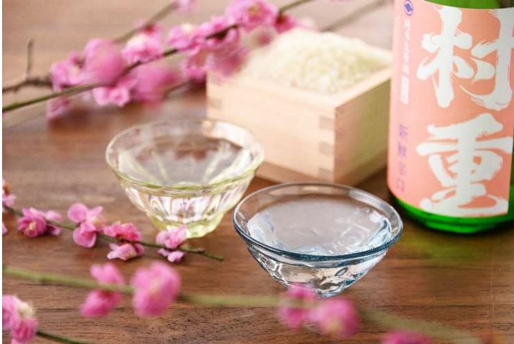
Sake Brewery [For illustrative purpose only]