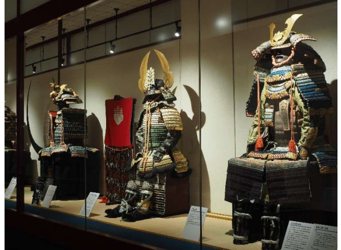
Kashiwabara Art Museum [For illustrative purpose only]