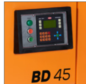
Dijital Kontrol Paneli İçin Digital Display Control BD Serisi Series