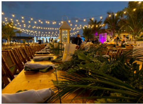
JUNGLE GARLAND AND TALL WHITE LANTERNS