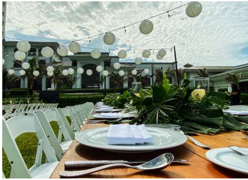
TROPICAL GREEN AND CLASSIC WHITE FUSION