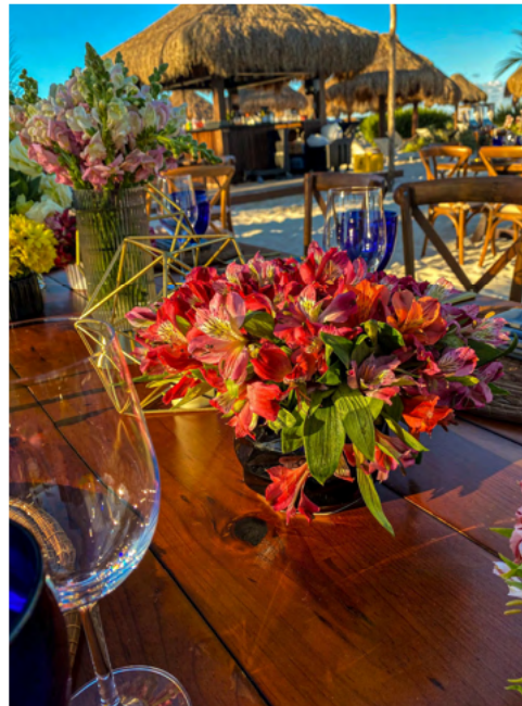
ACCENT COLOR POP ON NATURAL WOOD