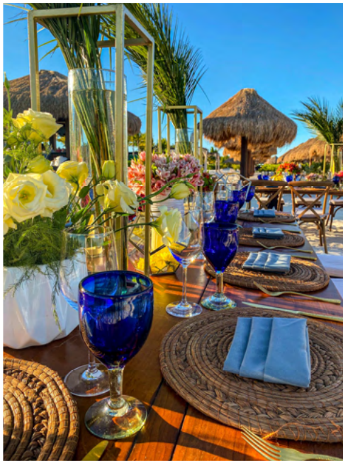
THOUGHTFUL BALANCE OF TEXTURE & COLOR