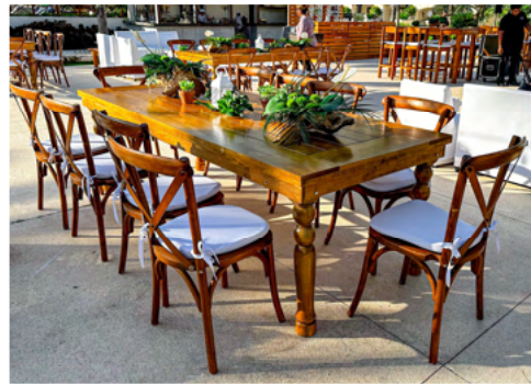
SWISS FAMILY ROBINSON CONCEPT TABLESETTING