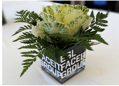
TROPICAL FOLIAGE IN CUSTOM VINYL VASE