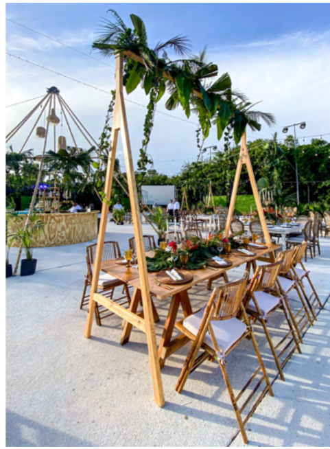
JUNGLE FOLIAGE ON RUSTIC A-FRAME STRUCTURE