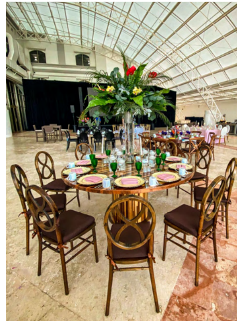
TALL TROPICAL FLORALS WITH VIBRANT HUES