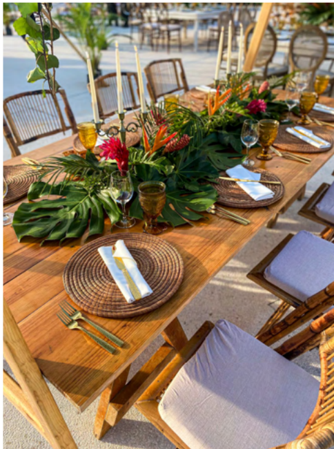
BIRD OF PARADISE ON LUST JUNGLE GREENERY