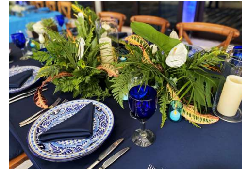
EXOTIC DRIFTWORK FLORAL DÉCOR

This fusion captures the vivid beauty of the tropical color palette, turning your table setting into a captivating focal point that leaves a lasting and unforgettable impression, echoing the lush allure of the tropics.