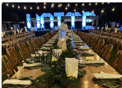
TABLE SETTINGS AND DECOR

Each of these components will play a crucial role in crafting a memorable experience, collaborating seamlessly to highlight the allure of the tropical jungle theme and curate a celebration that tells your unique story.