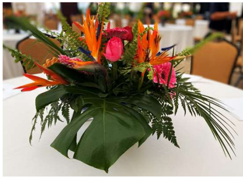
TROPICAL FLORALS WITH POPS OF ORANGE AND PINK