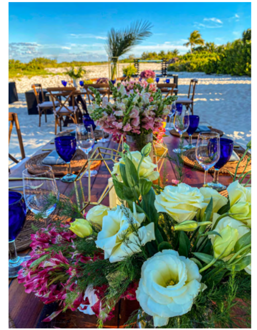
INCORPORATING COLOR INTO TROPICAL FOLIAGE