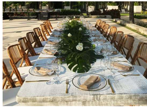
TROPICAL GARLAND WITH WHITE AND GOLD ACCENTS