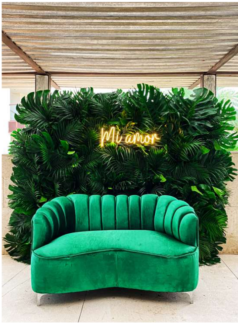
WELCOME TO THE JUNGLE PHOTO OPPORTUNITY