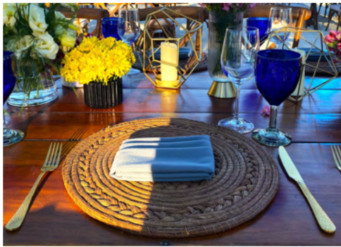
MIX OF TROPICAL TEXTURES WITH A TOUCH OF GOLD