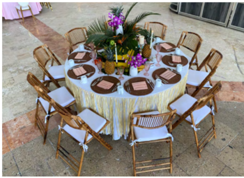
FRESH FLORALS & FRUITS FOR ALOHA VIBES