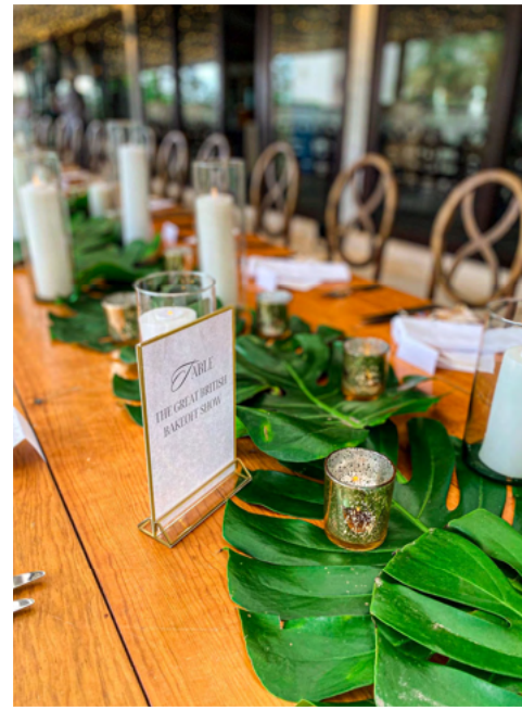
PALM LEAVES WITH GLASS AND GOLD ACCENTS