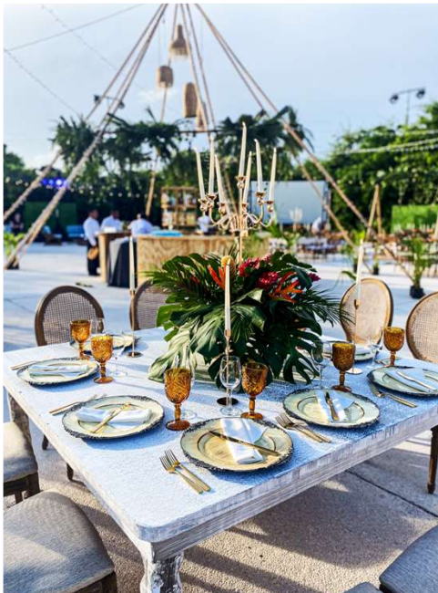
TROPICAL FOLIAGE ON GOLDEN CANDLEABRO