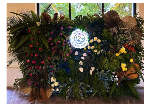
PHOTO OPS & ACTIVITIES

Lighting will accentuate essential features and establish an inviting ambiance that harmonizes with your style, guaranteeing that your celebration is a visually captivating and memorable experience.