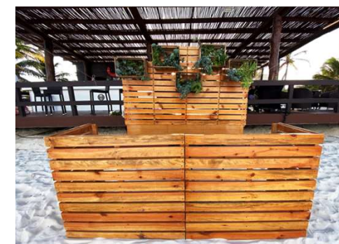
Photo ops and group activities act as engaging components that enable your guests to create connections through shared experiences and craft their own stories within the larger narrative of your event.