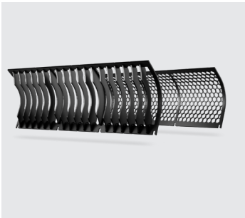
Screen Basket System