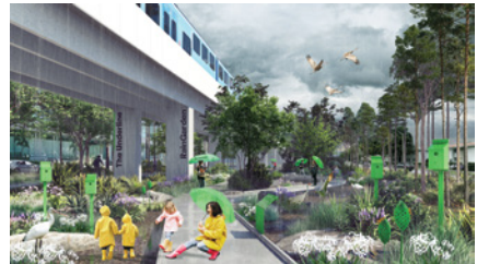
Rain Gardens Between Donatello Street and Orduna Drive