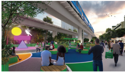
The Underline Plaza Directly south of the Douglas Metrorail Station