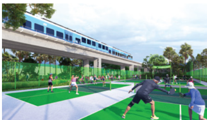
Pineland Courts Coral Gables near Carillo Street