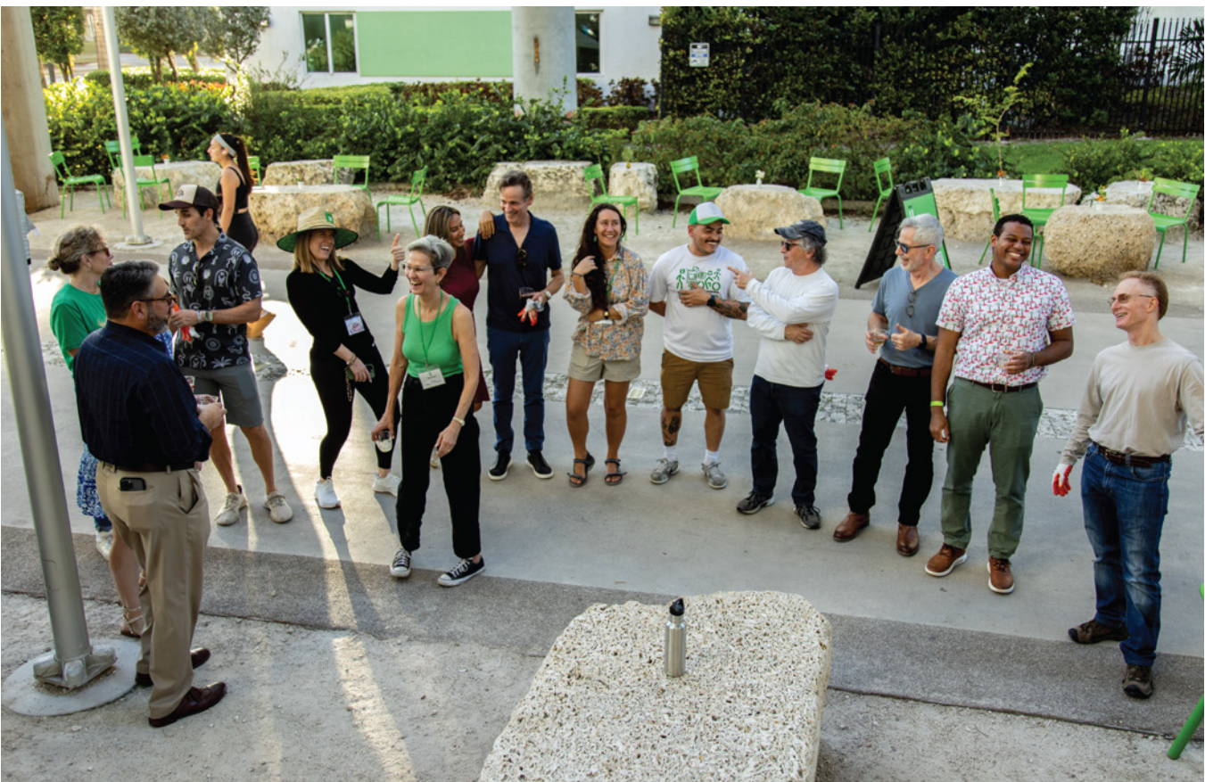
Atala Society members enjoy a wine and weeding event in the Oolite Room