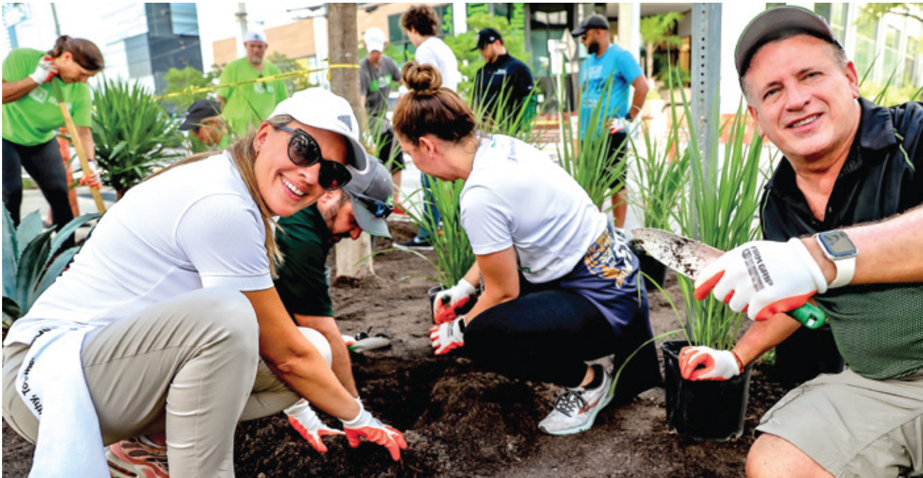
TD Bank volunteers beautify gardens in the Brickell Backyard Promenade

We celebrated a milestone this past fiscal year by receiving over 4,000 community service hours from 279 volunteers! Their dedication significantly impacted our operational capacity and fostered a more engaged and connected community.