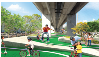
The U-Skate Park Red Road and Ponce de Leon Boulevard