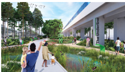
Stormwater Ponds Between Granada Boulevard and Donatello Street