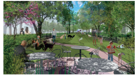
Bark Park Ponce de Leon Blvd and Le Jeune Rd