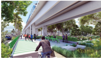
Water Balcony Coral Gables Waterway and Riviera Drive