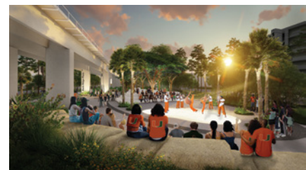
Rock Ridge Plaza At UM north of Stanford Drive