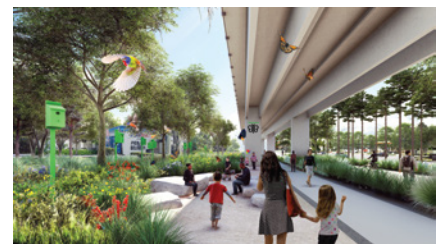
Butterfly Gardens Between SW 67th Avenue and SW 80th Street