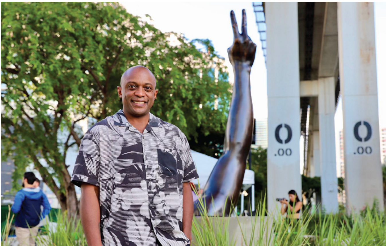
Duality with artist Hank Willis Thomas

Duality joins five other public artworks on The Underline including Water/Tables , Typee Sculpture Garden , The Allegory , Disappearing Treasures and In Tune with Nature .