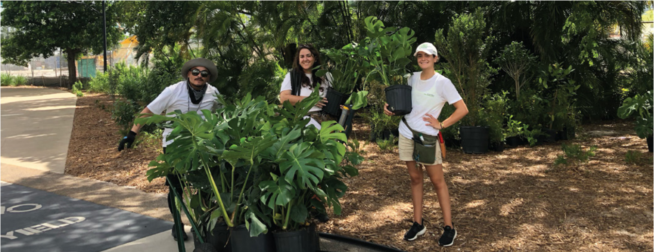
The Underline Green Leaders tending Brickell Backyard native plants