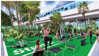
Fitness Room Behind the Gables Fire Station by Riviera Drive