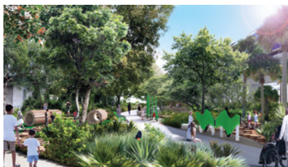
Play Forest By South Miami City Hall