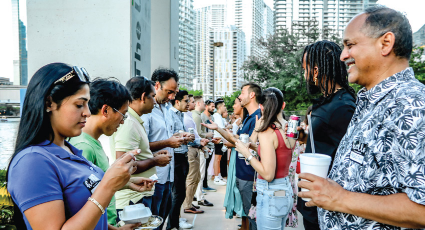
Community Connections: Speed Friending activation in the River Room