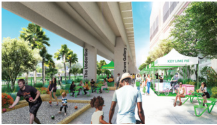
Grove Gallery Between SW 24th and 27th Avenues

See the planned amenity areas for The Underline's Phase 3