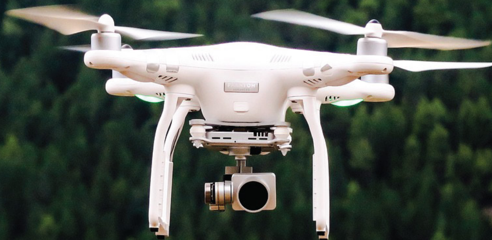
Drone camera video helps construct the digital twin