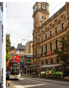
Holiday Inn Melbourne

CONDITIONS: Valid until 30 Oct 26 • Prices are correct as at 23 Mar 26 • Prices are thereafter subject to change without notice until time of confirmation. Prices may vary due to a number of factors including tax and surcharge increases, exchange rate movements and availability. • A non-refundable deposit FROM $1000 per person (based on 16-20 package), $1300 per person (based on 17-21 & 20-24 Jan packages), and $3500 per person (based on 26-30 Jan package) is due at the time of booking. NOTE: Deposit is dependent on what sessions are purchased • Full payment is required no later than 30 October 26 • Once fully paid packages will be 100% non-refundable. • All travel must be commenced and completed as specified • Min/max stays apply of 3 x nights • Twin share is based on 2 adults sharing a room, bedding configurations may vary • Advertised prices are per person based on payment by cash or cheque. Credit card fees will apply • Amendment and cancellation fees apply • Accommodation ratings are based on House of Travel ratings and are a guide only to the overall quality of the property • Packages are subject to availability • Please ask your House of Travel consultant for full details. HOT Code: EVTMELOA027