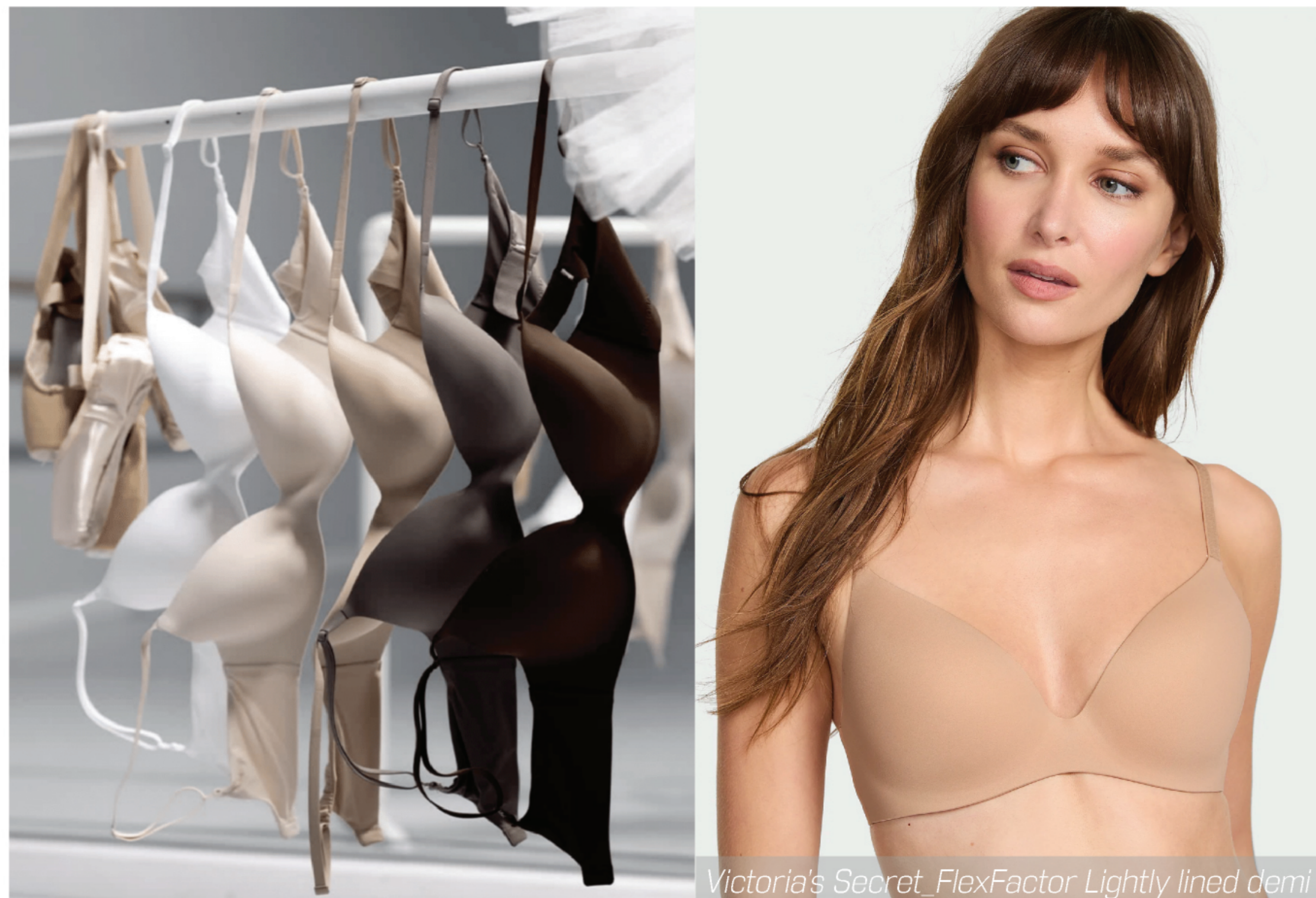
Figure-smoothing, seamless and flexible fits underwear are increasing. The wire-free and flex fit foam cup that adapt to shape as you wear them are important.

This range offer clean, comfort-driven, everyday essential styles that are invisible under clothes.