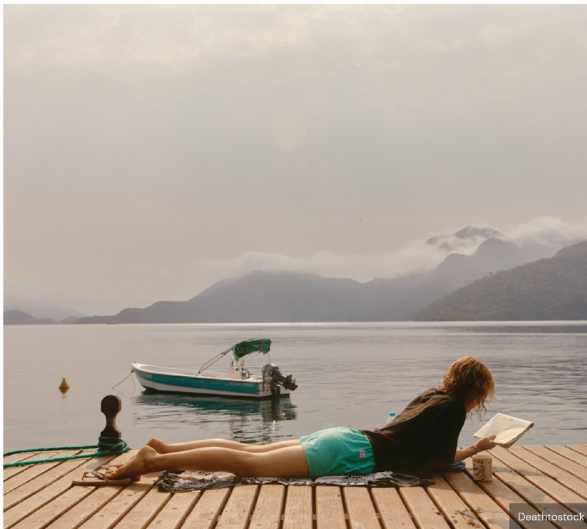
Travel spending is becoming more nuanced and complex across markets and demographics, requiring businesses to focus on emerging segments. Discover how to appeal to specific cohorts through our Travel Priorities report series, covering Alphas, Millennials, Gen X and Boomers

The theme continues with simple patterns and bright colors to create summer look and holiday mood.