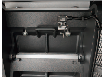
The third set of blades