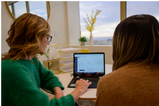
Kindbody virtual services

Once you have exhausted your five (5) sessions, you will receive discounted access to virtual coaching services.