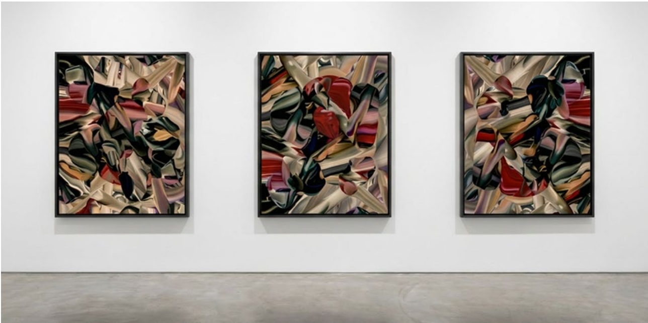
Abstract Portraits, Magricollages, from left to right: "Beloved cats, fat rats and a bit poison", 2021/23; "My heart skips a beat", 2021/23; Duck Tails, 2021/23