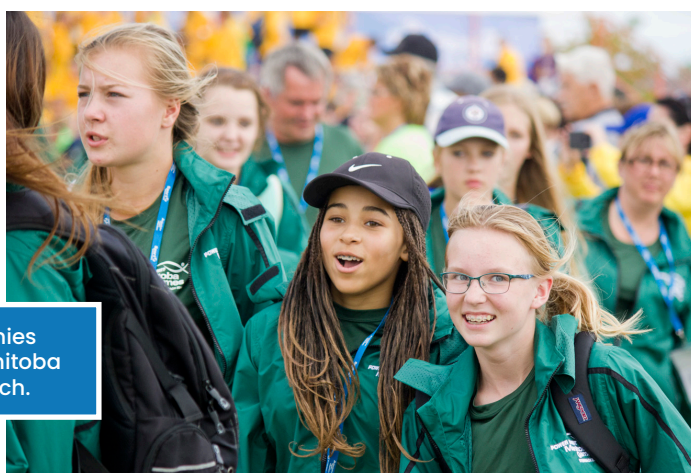
Opening Ceremonies from the 2016 Manitoba Games in Steinbach.