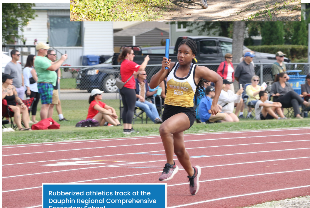
Rubberized athletics track at the Dauphin Regional Comprehensive Secondary School