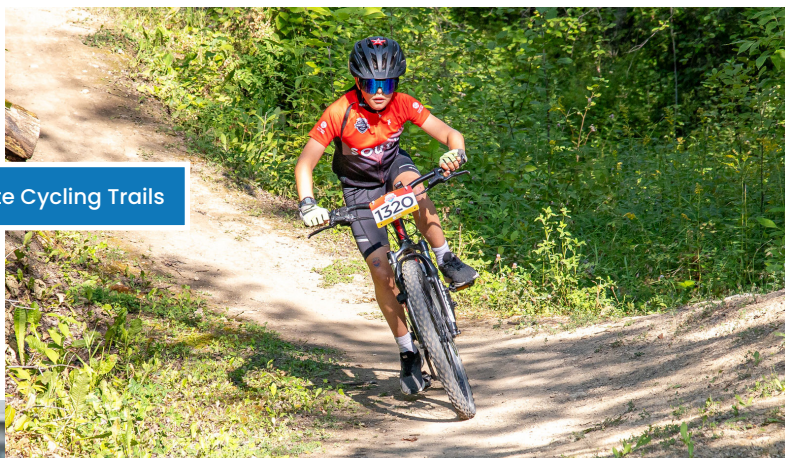
Northgate Cycling Trails