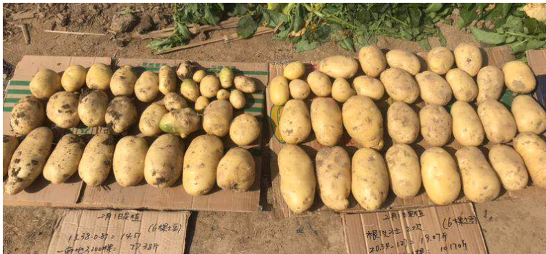
Treated potatoes (right) are larger and more uniform in size

Result: Sunrise treated field yielded 31.43% more than the control and had superior uniformity.