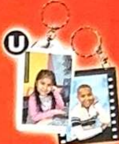
Acrylic Key Holders