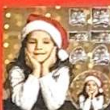
Photo Stone Slate