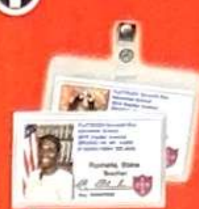
Plastic ID Badges