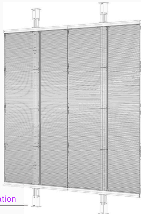
Easy and quick installation