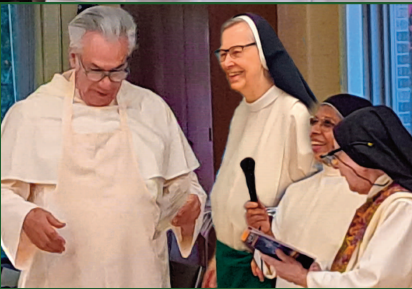
Father even wore a party apron.

Father shared a photo presentation of his visits to Monasteries in Europe, Asia, North and South America, for example: Ecuador, Spain, Poland, Italy, Japan, Korea, Portugal, Vietnam or the Philippines, allowing us to experience the true meaning of our Order as “the Dominican Family.”