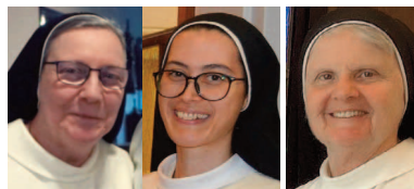
Presented by our Vocation team with

When I found Him Whom my heart loves ... I would not let him go! Song of songs