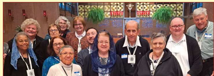
Our Dominican Family and our loved ones are ever in our hearts before the Lord.