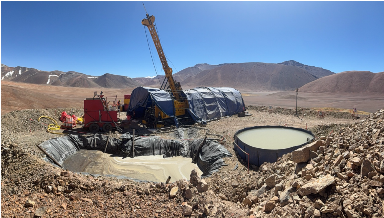
Above: Drilling has commenced at Stockwork Hills target

Drilling is planned to continue to the rest of the priority targets highlighted in Figure 1 above as the season progresses. Access works and platform construction are underway for the the targets and access and permitting are advanced for the priority Chilean targets that were identified at the end of last season.