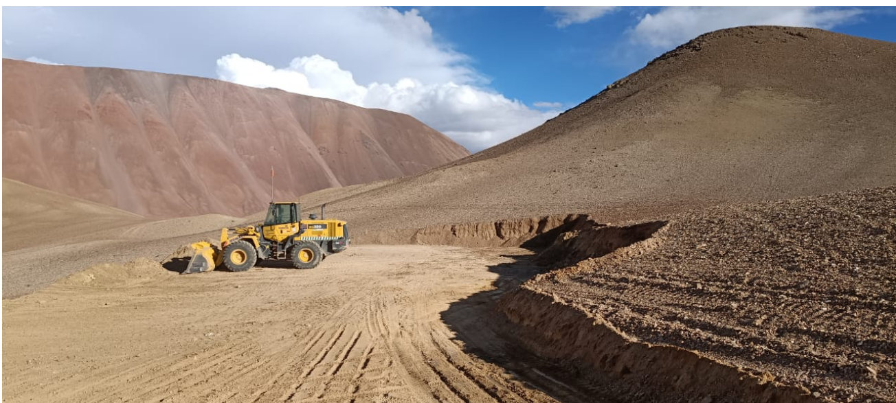
Below: Platform construction well underway at other priority targets