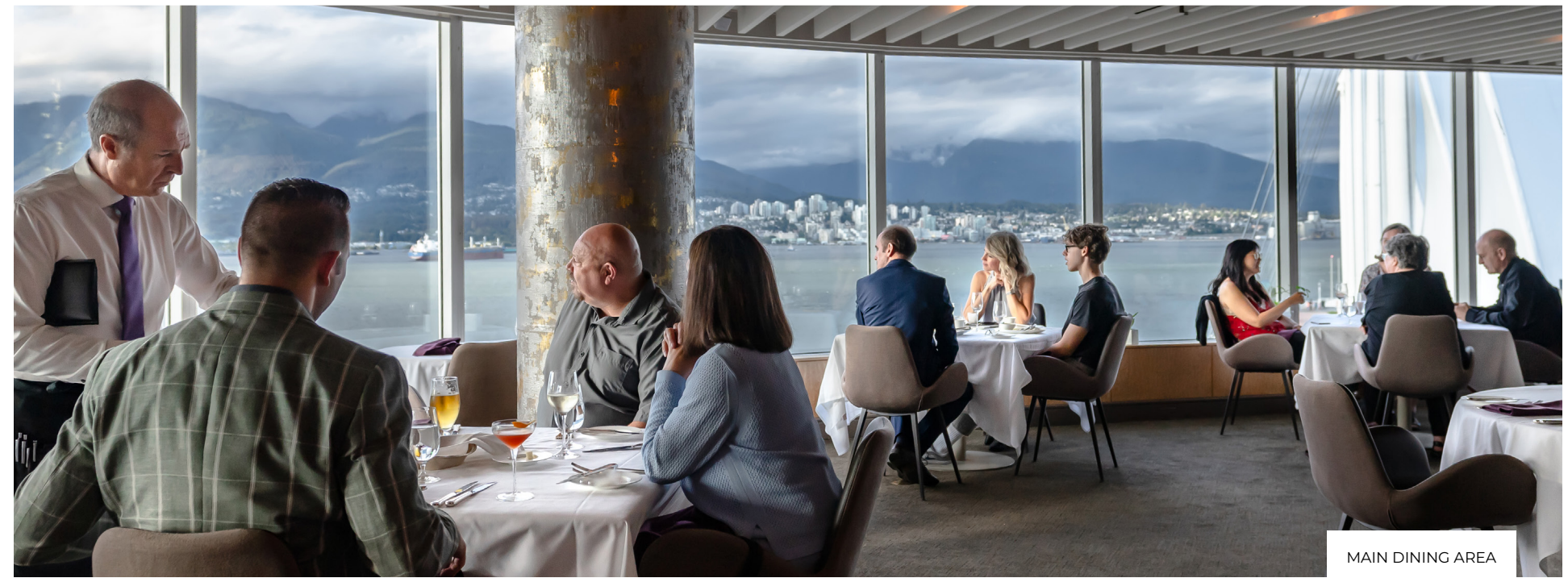
MAIN DINING AREA