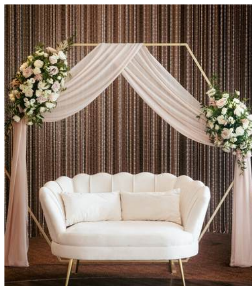
The decoration shown comes from our partner.

Availability and prices based on a wedding ceremony only and not in combination with a dinner, reception or party night within Lommerrijk are subject to negotiation.