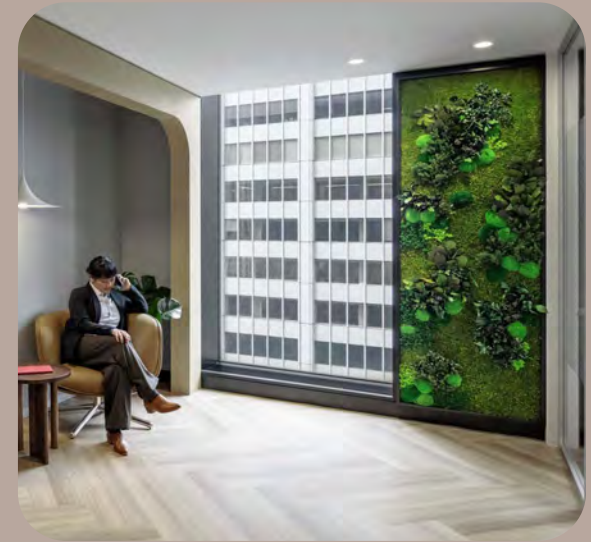
How Safe is Your Moss Wall/Preserved Gardens