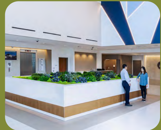
Preserved Planter Insert for Veterans Government Office — San Diego, CA