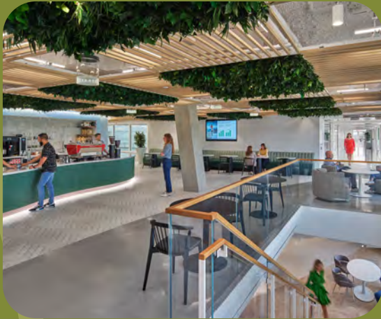
Neuroaesthetics @ Workplace Consulting Firm — Washington, DC