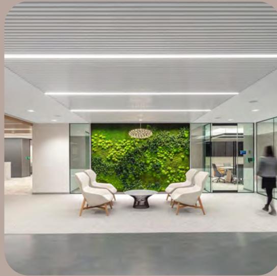
Transforming Healing Environments with Nature Inspired Interiors