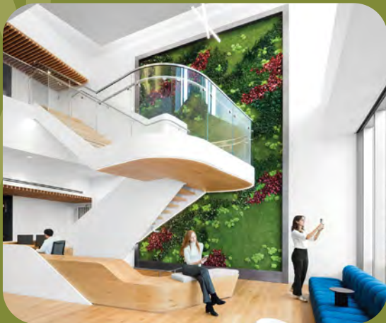
Preserved Gardens @ Workplace Pharmaceuticals Office — Cambridge, MA