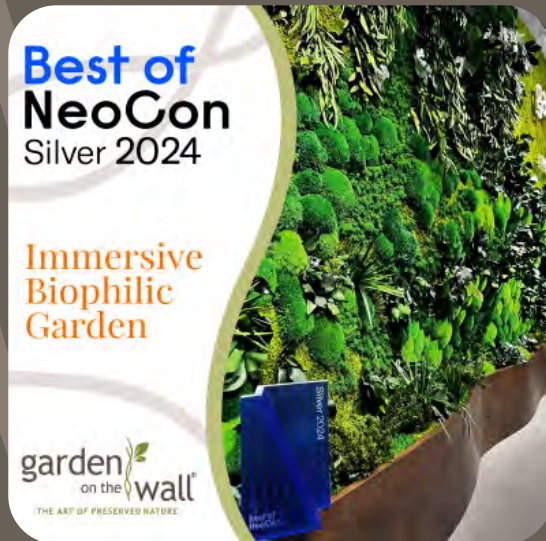
Garden On The Wall® Takes Home Best Of Neocon Silver Award!