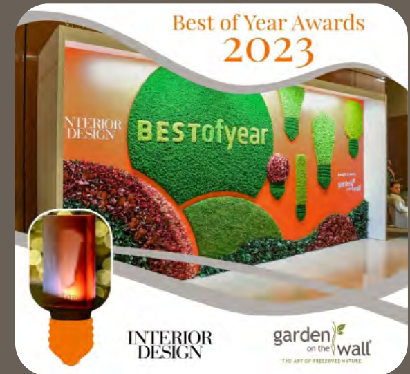
Garden On The Wall® Wins Id Magazine Best Of Year Award!