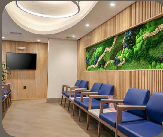
Gardens with Moss & Foliage with Flower Foliage