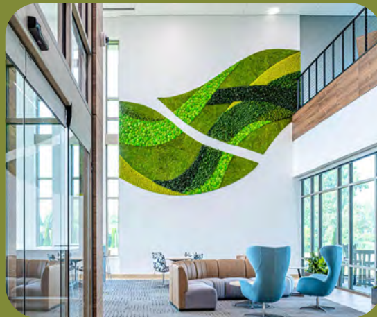
Biophilia Design @ Life Sciences Dietary Office — Greenbay, MI