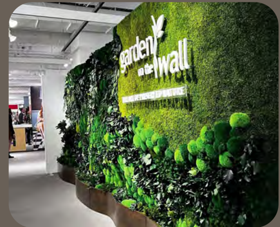
3D Biomimicry Gardens