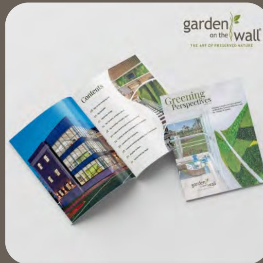
Garden On The Wall® Releases All-New Brochure 'Greening Perspectives'!