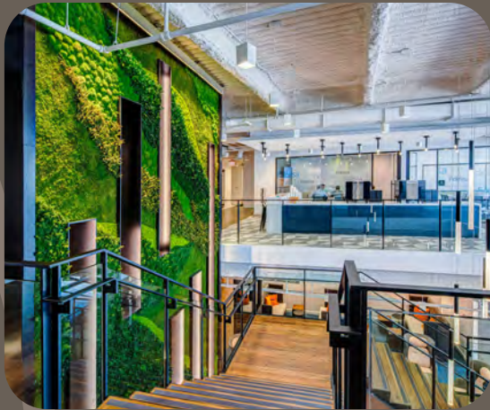
Gardens with Moss & Foliage