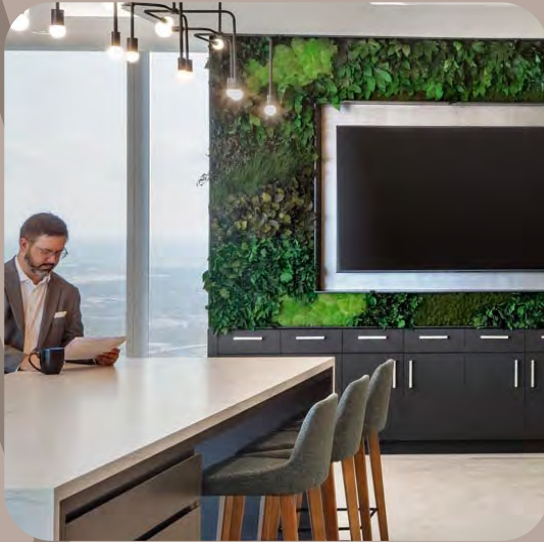
The Mental Health Benefits of Sustainable Indoor Nature