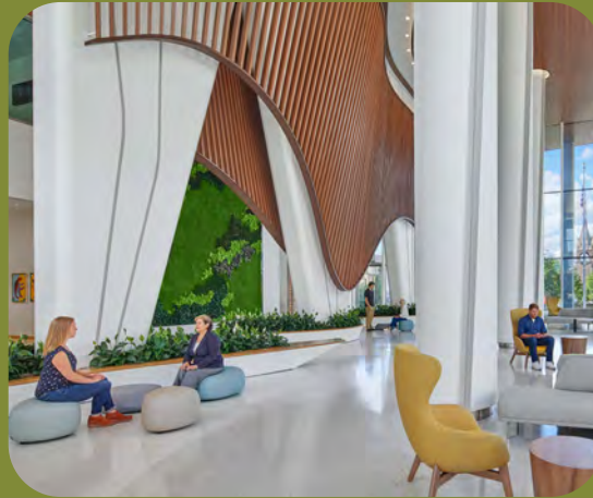
Biophilia @ Healing Environment Healthcare Facility — Duluth, MN