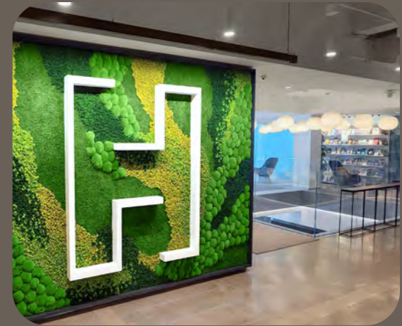
Gardens with Moss Combinations