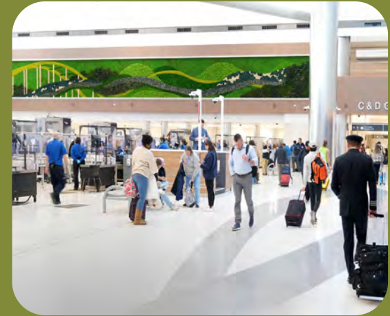
Wellness & Storytelling @ Transit Hub National Airport — Nashville, TN