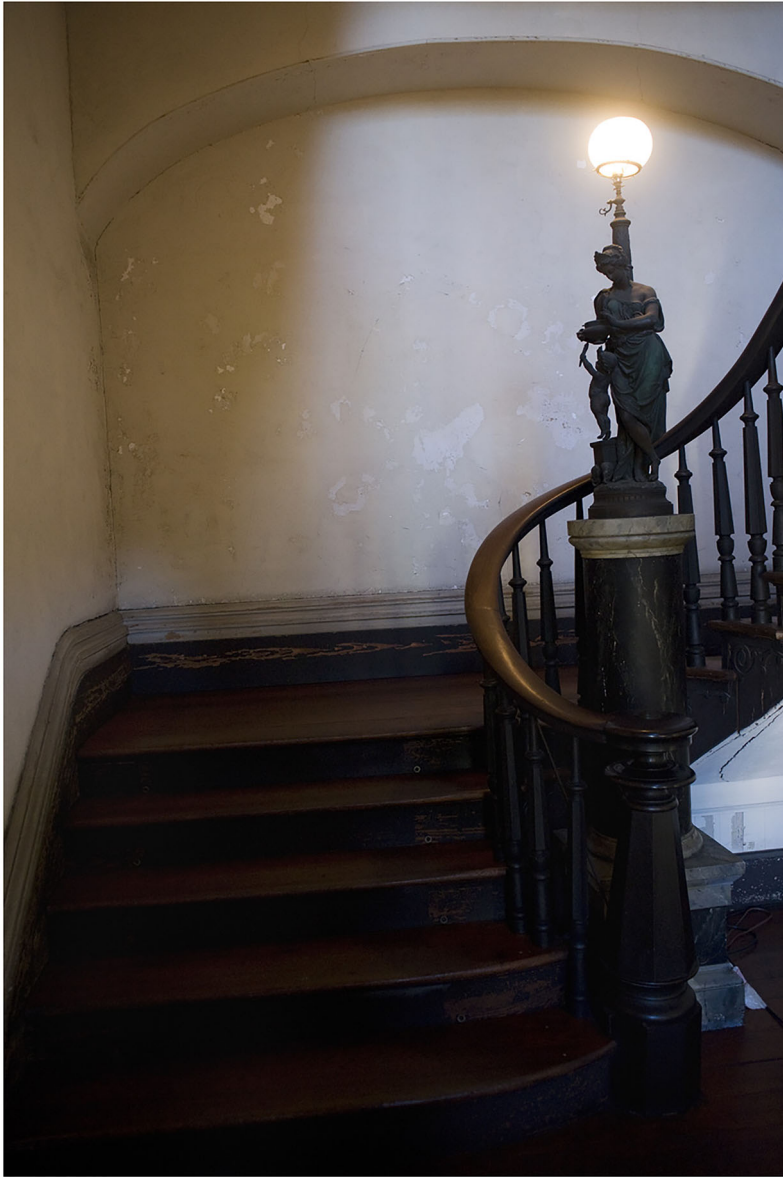
Figure 6. Aiken-Rhett House Interior.

inaugural Freedom Scholar Award that year. I had been the only person on the tour of the house (which many websites, I later learned, reported to be haunted)—a mistake, I realized instantly, but I was at that point too drawn in to abruptly leave.