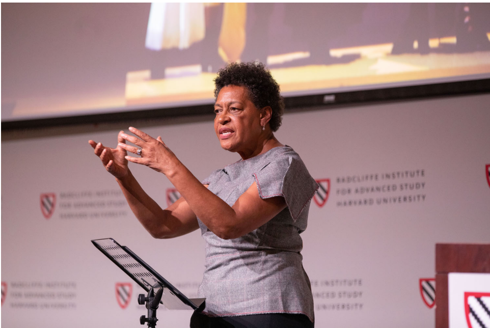
Figure 2. Carrie Mae Weems, Grace Notes: Reflections for Now , Vision and Justice Convening, April 25, 2019.