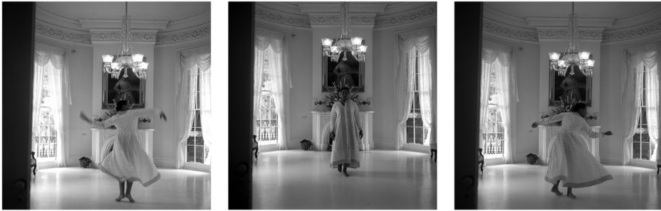
Figure 5. Carrie Mae Weems, A Single Waltz in Time , from The Louisiana Project , 2003. Gelatin silver prints. © Carrie Mae Weems. Courtesy of the artist and Jack Shainman Gallery, New York.

guiding us into the history of such houses—the architectural index of these institutions—but also calling our attention to what has been lodged into the foundations of the terrain itself. 39 At the left in a triptych of black and white photographs, A Single Waltz in Time from The Louisiana Project series, we see a white-walled, light-filled grand parlor complete with a chandelier over Weems’s back-turned body, barefoot in a white, spotted cotton dress. Directly above her is a portrait with a thick frame, the figure’s head completely obscured by the chandelier above, catching the light from the two windows to the floor (Figure 5). The only full figure we see in this photograph is Weems’s own, the blurred trace of her body captured by the long exposure time that shows she has been spinning and swaying her arms, a corporeal whirling that suggests, as Kimberly Juanita Brown notes, the “controlled release of a ballerina.” 40 The sequence of the prints turns an ambulatory surveillance of the plantation house and grounds—a site of ownership—into a counternarrative of self-possession.