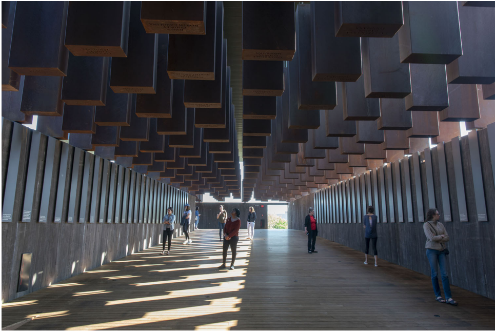
Figure 8. National Memorial for Peace and Justice, Montgomery, Alabama, 2018.