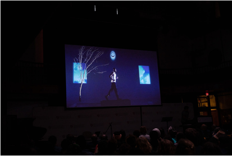
Figure 4. Carrie Mae Weems, Grace Notes: Reflections for Now, Vision and Justice Convening , April 25, 2019.

meditation on a set of considerations to offer.” With that, she cleared and altered the parameters of the work and its discursive potential.