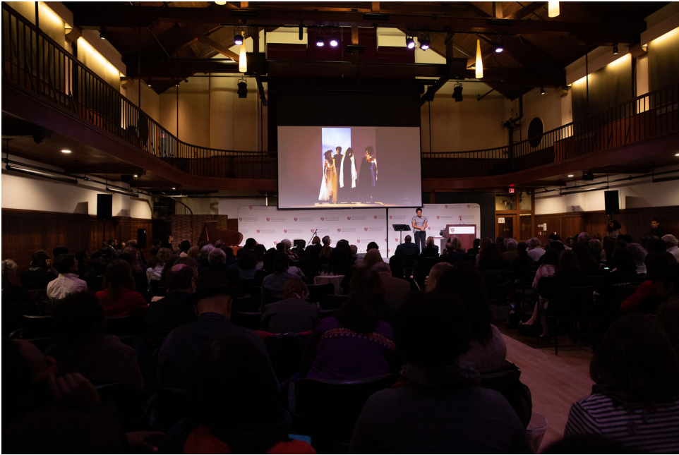
Figure 1. Carrie Mae Weems, Grace Notes: Reflections for Now , Vision and Justice Convening, April 25, 2019.