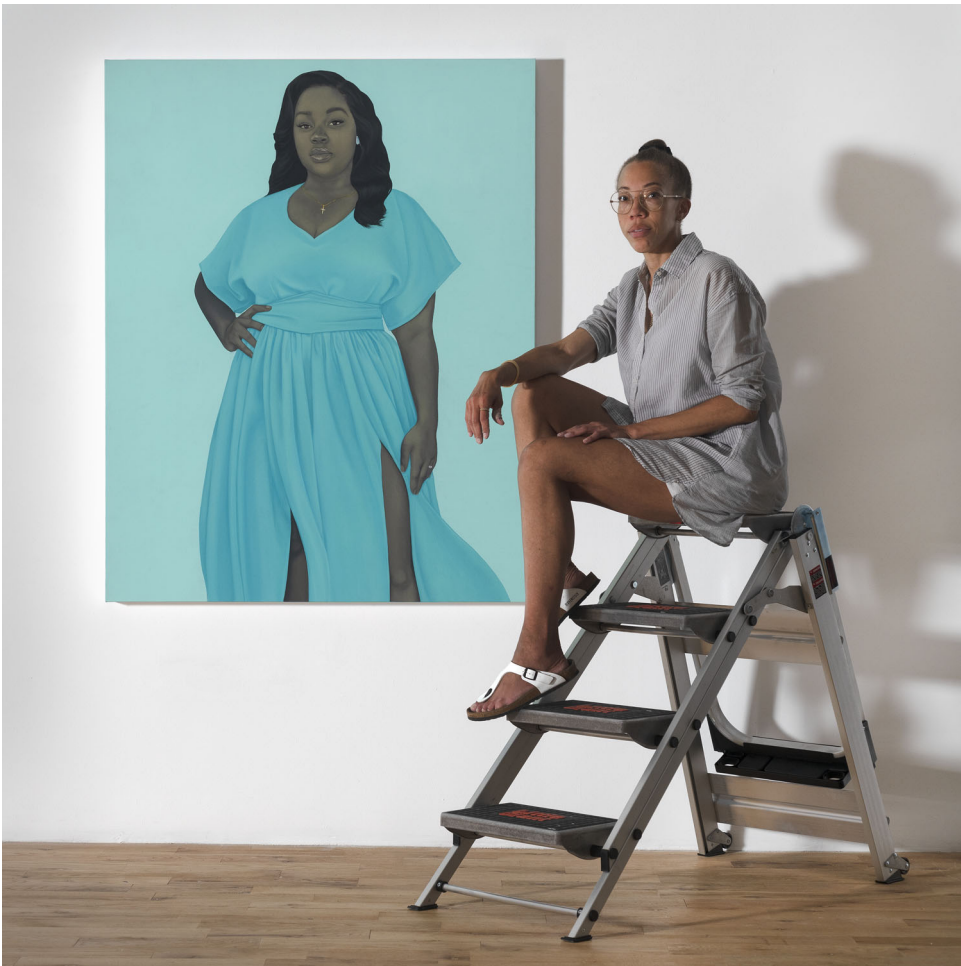
Figure 10. Photograph of Amy Sherald with her portrait of Breonna Taylor, 2020.

rejoinder to the spatial conditions that their projects exemplify and point to the shape-shifting function of time, distorted through the recursive logic of SYG law, which results in what Shatema Threadcraft aptly frames as the retroactive blame ascribed to SYG law’s victims. 61