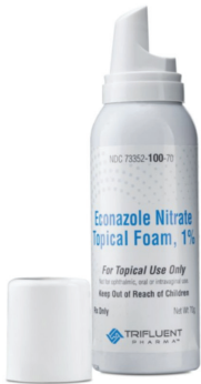
Figure A How to apply econazole nitrate topical foam: