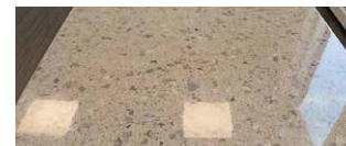
Terrazzo ARMADILLO Flooded