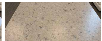
Terrazzo ARMADILLO with LABFENDER 240