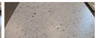
Terrazzo DENALI with LABFENDER 240