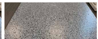
Signature 1/16" NIGHTFALL with LABFENDER