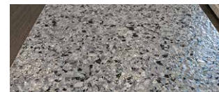
Signature 1/4" NIGHTFALL