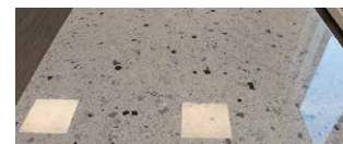
Terrazzo DENALI Flooded