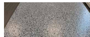
Signature 1/16" NIGHTFALL