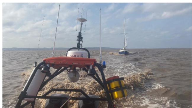
The yacht under tow behind SARA Lifeboat 1

On 21 March a yacht had suffered engine failure and called for assistance with a 'Mayday' message. SARA Lifeboat 1, with her twin 150hp engines, was able to tow her back to Beachley - though it took two hours going against the outgoing 8 knot tide!