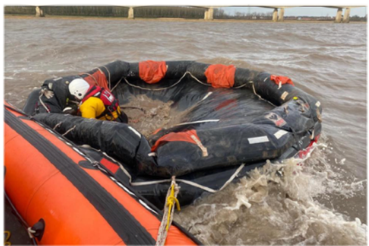
The Unidentified Floating Object

On 7 March we were paged by Milford Haven Coastguard Operations Centre to reports of a dinghy adrift just off Caldicot Flats. SARA Lifeboat 1 'The Jim Hewitt' was launched to what turned out to be a very large life raft. This was recovered and handed over to Chepstow Coastguard to make enquiries as to the owner.