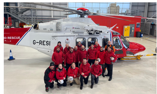
At St Athan (everyone loves a helicopter)