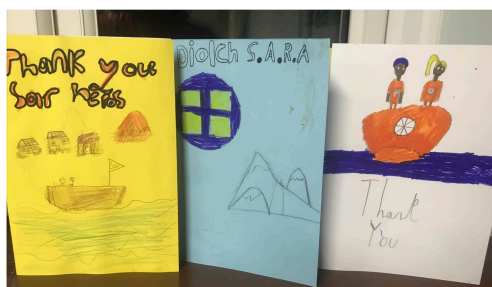
Cards from Monmouth Schoolchildren