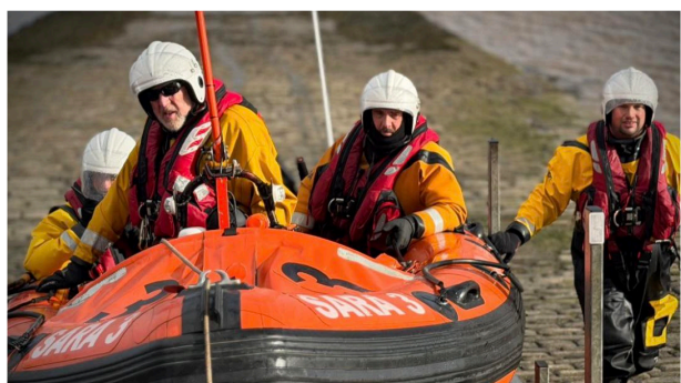
SARA Lifeboat 3 returns from the EPIRB search, after over 4 hours on the water

The jet ski had also broken down, so they towed it back to safety and returned for the drifting vessel - which had managed to restart its engine but then ran out fuel. They towed it back too, so it could be safely recovered.