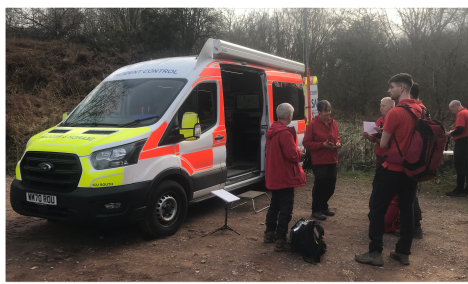
Search Control in the Forest of Dean