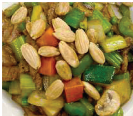
Almond Guy (Chicken) Ding