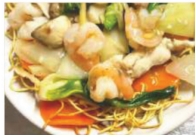
Tang's Chow Mein