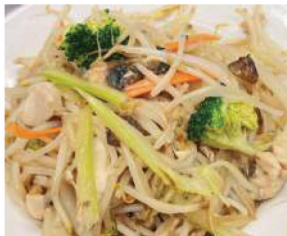
Chicken Chop Suey (no noodles)