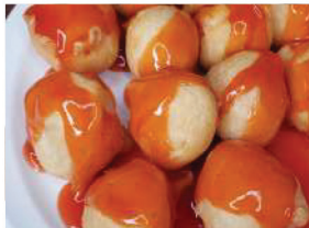
Sweet & Sour Chicken Balls