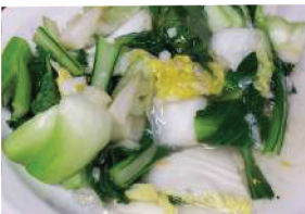
Stir Fried Asian Greens