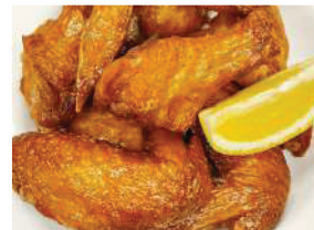
Jar-Doo(Soy Ginger) Chicken Wings