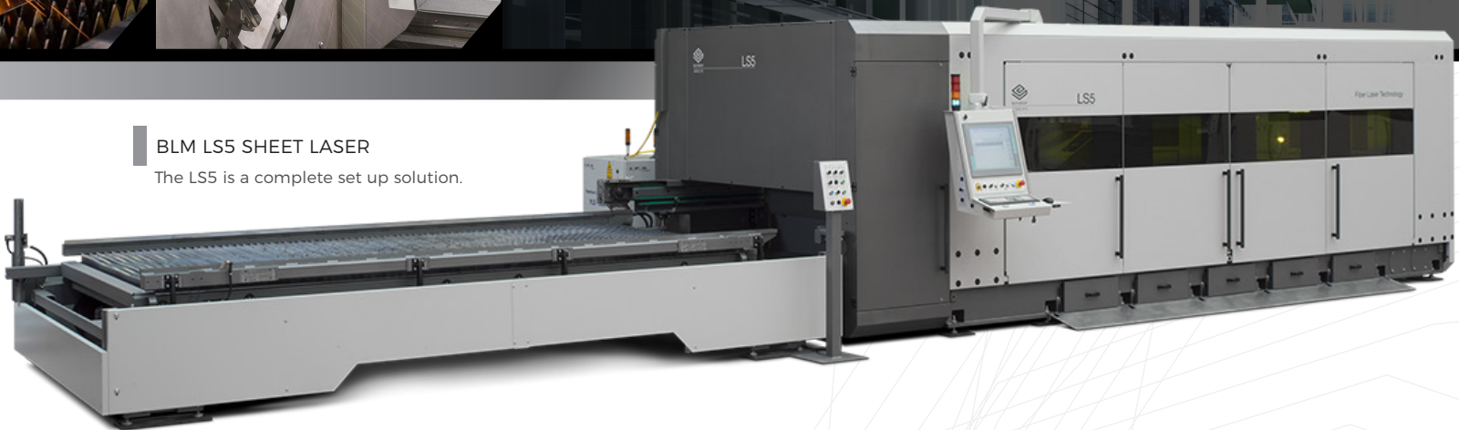
BLM LS5 SHEET LASER The LS5 is a complete set up solution.

ACS partners with BLM in the Pacific Northwest as BLM defines the meaning of Advanced Manufacturing Solutions used in Traditional Manufacturing & Fabrication.