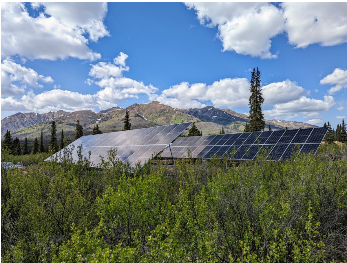
Solar panels in position at Snowline's newly built Forks Camp. Designed by Solvest Inc. the 27-kW hybrid-solar generator system is among the first of its kind to be used to power a remote exploration camp in Canada.

base for its operations in the area, and is permitted through to 2026. The Forks airstrip has been upgraded and extended to 3,000' to accommodate larger aircraft. The Company installed a 27-kW solar generator facility at the Forks camp in June and July 2022, under a 5-year lease from the Nacho Nyak Dun Development Corporation. The facility provides a majority of camp's electrical power during the summer exploration season, cutting down on fuel consumption, carbon emissions, total support flights needed and general background noise in camp.