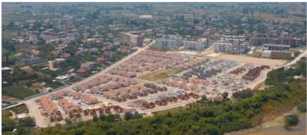
A reconstructed Thumane, Albania

Thumane, a post-earthquake village in Albania, is a good example of how a coherent government management group was able to transform a devastated informal settlement into a well-planned neighborhood with social infrastructure.