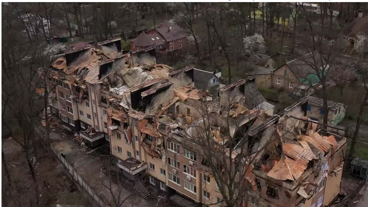
Damage to apartment blocks in Irpin video