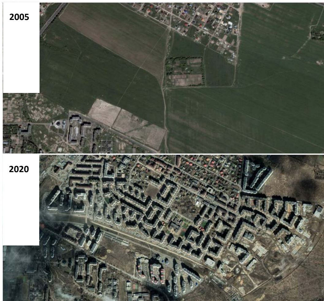
Figure 3.2: The development of Sofiivska Borschahivka 2005 to 2020