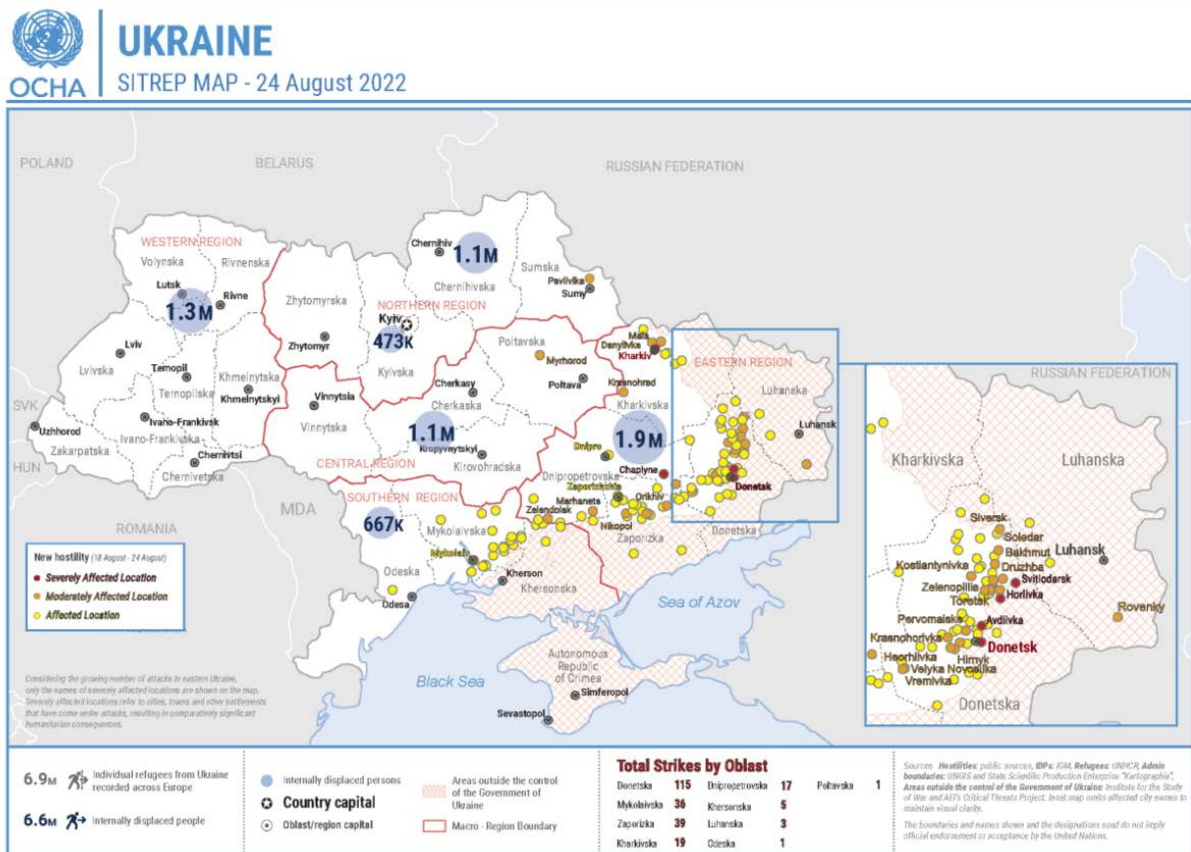
Figure 5.1: UN IOM Situation Report 24 August 2022

In keeping with the timeliness of Lidia’s presentation, we have included the latest version of UN Situation Report map she used. Despite the change in Russian military objectives, IDPs continue to be distributed across Ukraine. The total number of IDPs fell by 500,000 to 6.6 million whilst the number of refugees to Europe rose by 1.9 million.